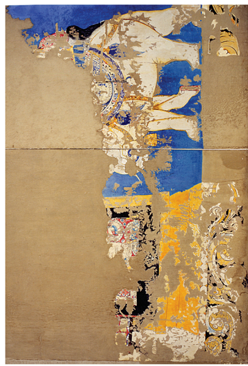
Fig. 3. "Ambassadors Painting," Samarkand, c. A.D. 660: left part of the southern wall, showing the procession of sacrificial animals to the mausoleum of royal ancestors.