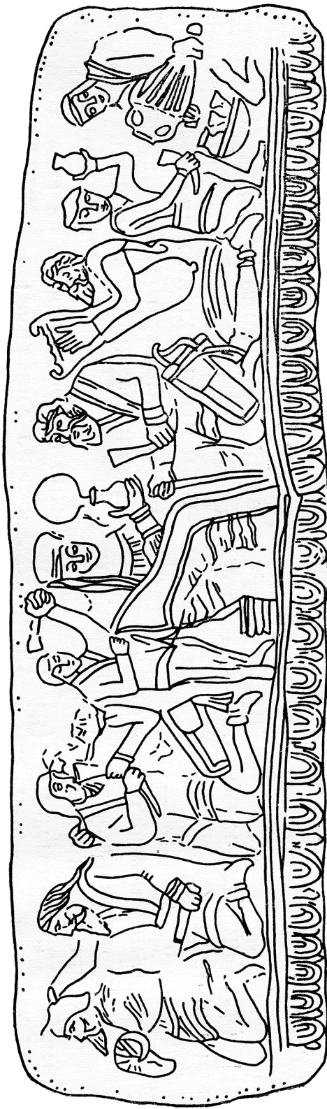
Fig. 1. A figure from the royal portraits gallery, Akchakhan-kala (Khorezm), end 1st c. B.C./beginning 1st c. A.D.