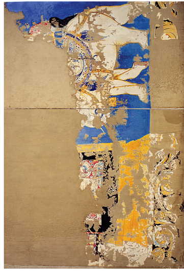
Fig. 3. "Ambassadors Painting," Samarkand, c. A.D. 660: left part of the southern wall, showing the procession of sacrificial animals to the mausoleum of royal ancestors.