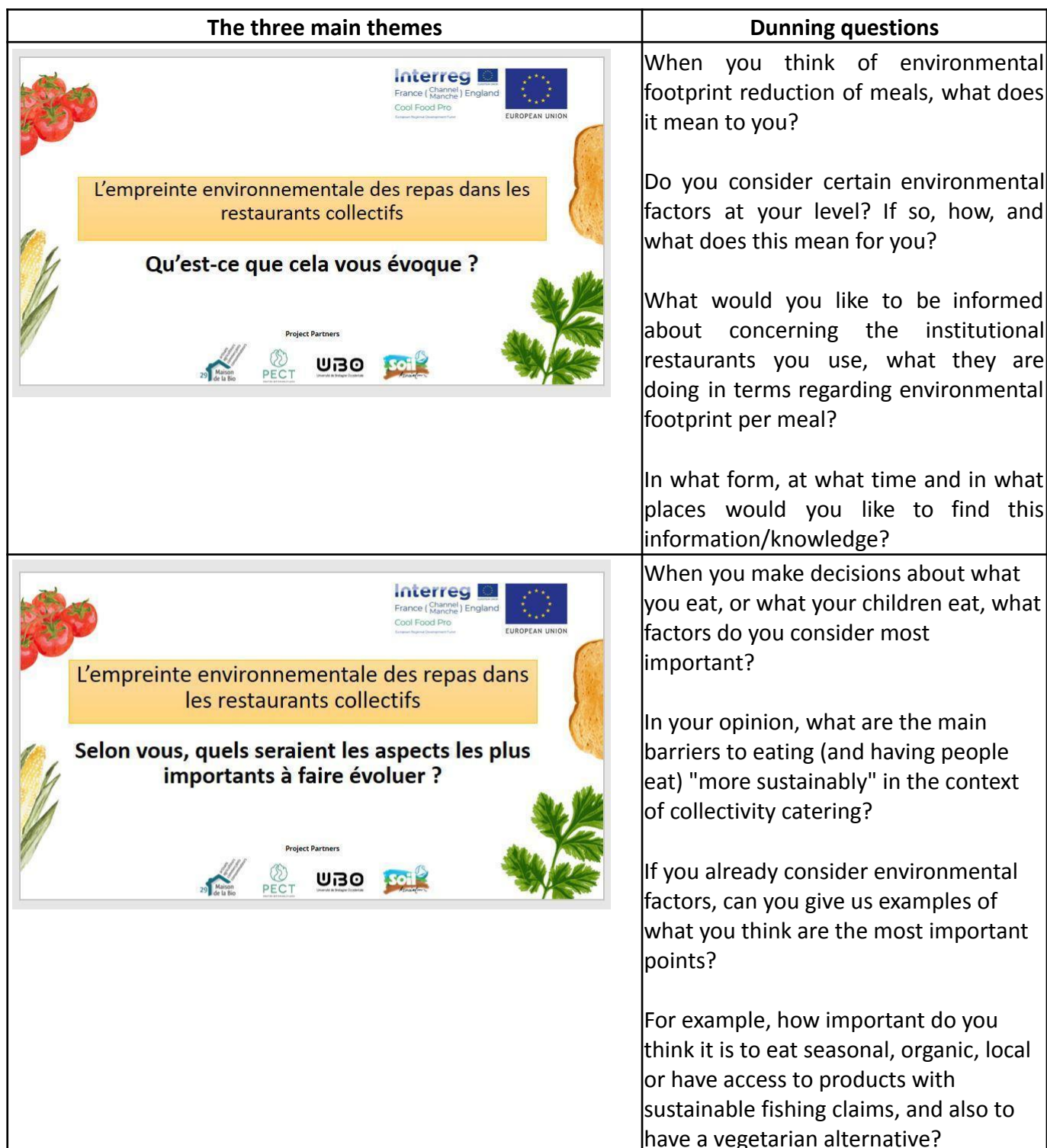
Table 5 - Interview guide for Focus Group Guests - Main themes and follow-up questions

sign before the start of the focus group, a sign-in sheet and a project presentation document that was given to the participants during the face-to-face focus groups (focus groups 1 and 2 in France).