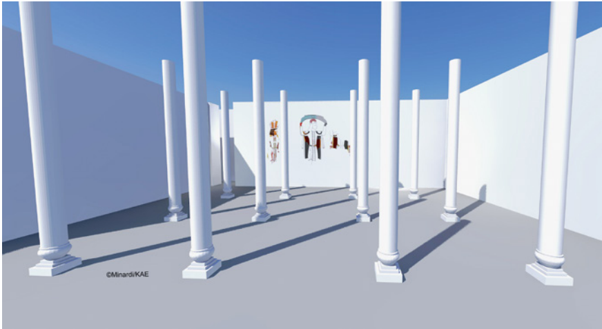
FIGURE 7 Akchakhan-kala, the main columned hall (throne room) of the Ceremonial Complex. Interim 3D reconstruction