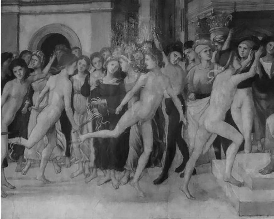
FIGURE 10 Venice, Galleria dell'Accademia, detail of a 16th century painting with representation of the Lupercaleia

ing a wind instrument, of which the fragments were found in two rooms of the “High Palace” of Toprak-kala. When a description of this modelled material was published by Yury Rapoport, the possibility that the object covering the mouths of these figures was not a simple mouth-piece for a flute but a padām was briefly contemplated. 19 However, Rapoport did not focus on this idea for long. 20 Now that we have the Akchakhan-kala’s “bird-priests” series, it seems very possible that the Toprak-kala sculptures could have depicted the same creatures. In the case of the clay fragment from the “Hall of Warriors” of the palace, the individual portrayed has his arms crossed on the chest, a clear gesture of deference. In another case (that of “Room 8”), a human bust wearing