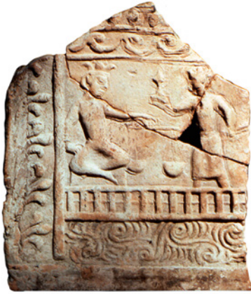
FIGURE 2 Sogdian ossuary from Samarkand, ca. 7th century AD

position had increased progressively during the Parthian and Sasanian periods, in relation to the growing power of the priestly class, which identified him as its chief protector. 3 Today, however, we shall see how recent discoveries testify to his extreme importance in a much earlier period, both in Chorasmia and Sogdiana.