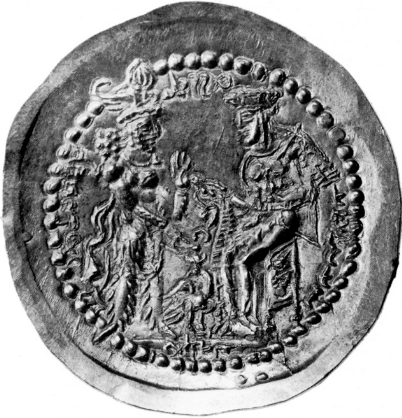
FIGURE 13 Reverse of a Kushano-Sasanian gold coin issued in Balkh, 4th century AD

in Balkh in the 4th century AD by the later Kushano-Sasanian Hormizd II shows the king pouring a libation in front of a statue of Anāhitā, identified by its legend (fig. 13); instead of a fire altar, again, a bird, unfortunately difficult to classify (a peacock?) receives the libation. 30 In the Kārnāmag ī Ardashīr (x.7), the Middle Persian romance on the founder of the Sasanian dynasty, a red rooster rescues the king in a dangerous circumstance: it is explicitly identified