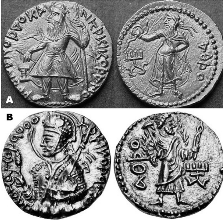
FIGURE 12 Kushan gold dinars with depiction of Āthar. A: Kanishka; B: Huvishka ©COININDIA; ©CNG 105 – LOT 545

Kushano-Sasanian ruler (name illegible) shows him pouring a libation on a bird, probably an eagle; 27 at Surkh Kotal, the best known of the “dynastic” Kushan sanctuaries, a fire altar added during the Sasanian occupation has its platform surrounded by eagles. 28 Additionally, an unfinished relief from the upper citadel of the sanctuary, discovered as re-employed in a stone bench inside Tower XIII of the peribolos, bears the depiction of two birds, a peacock (?) and a cockerel, standing on what we reckon is an altar. 29 A gold coin issued