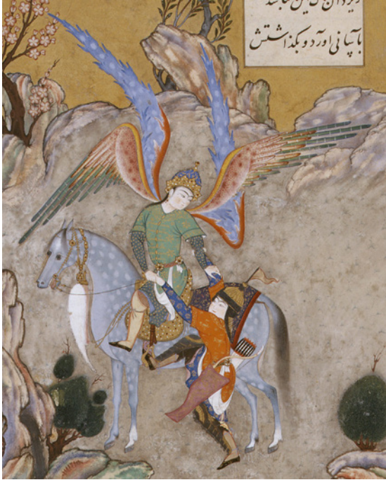
FIGURE 1 “The Angel Surush Rescues Khusrau Parviz from a Cul-de-sac”, Folio 708v from the Shahnama (Book of Kings) of Shah Tahmasp (ca. 1530–1535), detail

In the Shāhnāma , the 11th century poem by Ferdowsi celebrating the glory of pre-Islamic Iran, Zoroastrian gods are almost never mentioned by their real names. Except for a single passage in which a prayer said by Rostam enumerates the Amahraspands (“Bounteous Immortals”), 1 the only exception is Srōsh, in Avestan Sraosha. Srōsh is the patron of prayer and ritual activity who shares with the chief demon Ahriman the honour of being named. In contrast, Ahura Mazda, the supreme god, is cautiously named only as khodā , khodāvand , “the Lord”, whereas Mihr , Mithra, is just the name of the Sun. In the Shāhnāma Soroush, who is named “angel” ( fereshta ) in order not to upset Islamic monotheism, still plays an important role as the winged messenger of God (fig. 1). 2