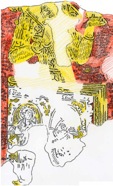
FIGURE 4 Drawing of a wall painting fragment from Pendzhikent (F. Grenet, adapted from Shenkar 2014, fig. 141)

dynasty. In the Rabatak inscription, it is explicitly stated that Srōsh “is (also) called Mahāsena ”. 7 Mahāsena is an Indian warrior god, sometimes considered a son of Shiva . Iconographically speaking, Mahāsena is portrayed on the coins of King Huvishka as an Iranian god (fig. 5); his attributes are a sword and a staff surmounted by a rooster, a bird closely associated with both Srōsh and Mahāsena , albeit for different reasons: in the case of Mahāsena , the rooster symbolizes the agitation of young warriors, and in the case of Srōsh , the rooster wakens the faithful and calls them to the morning prayer. The Kushan image most probably played on the double meaning of the symbol. 8