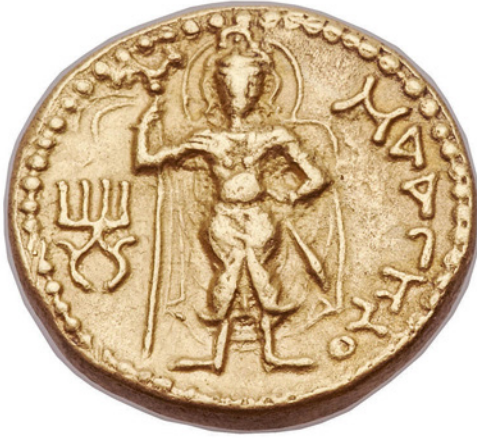
FIGURE 5 Gold dinar issued by Huvishka depicting on its reverse the god Mahāseṇa ©NUMISBIDS, LOT 29162

and died in China. These “bird-priests” combine the body of a rooster (characterized by its spurs and tail) and the head, arms and bust of a Zoroastrian priest solemnizing a service. 10 Their mouths are, in fact, covered by the padām , the ritual mouth covering meant to preserve the purity of the fire while the prayer is being uttered, and the priests’ hands hold the barsom , the bundle of twigs manipulated during the service. Several specimens also wear a tight soft cap used to avoid any accidental pollution of the fire. All of these elements still today characterize Zoroastrian priests. Very often the “bird-priests” are seen in pairs, and on the Zoroastrian reliefs from China, a pair of “bird-priests” always flanks a fire altar.