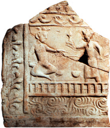
FIGURE 2 Sogdian ossuary from Samarkand, ca. 7th century AD

position had increased progressively during the Parthian and Sasanian periods, in relation to the growing power of the priestly class, which identified him as its chief protector. 3 Today, however, we shall see how recent discoveries testify to his extreme importance in a much earlier period, both in Chorasmia and Sogdiana.