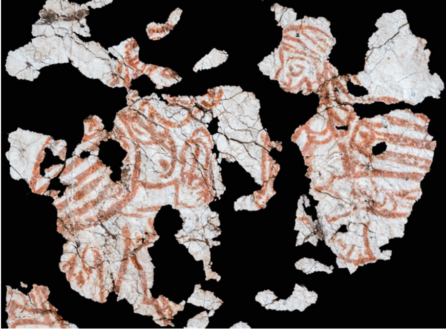
FIGURE 8 Detail of the decoration of the tunic of the god Srōsh with depiction of “bird-priests” holding a martinet

Avesta, which consisted of a long lash that was more harmful to people when used, as it was, to punish slaves or criminals. 16 Interestingly enough, in the 1960’s at Sharifabad near Yazd, the sraošō.caranā was still used against unruly boys specifically by the sraošāvarez , that category of assistant priests of which Parōdarsh is the symbolic representative when in association with Srōsh. 17 We believe that this new discovery definitively settles the question of the identification of the Akchakhan-kala colossal god with a mural crown as being Srōsh.