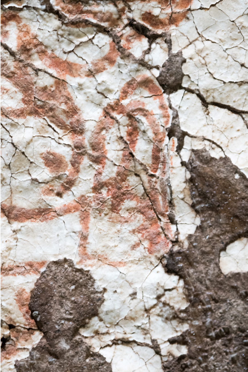
FIGURE 9 Detail of the previous figure: the martinet or sraošō.caranā