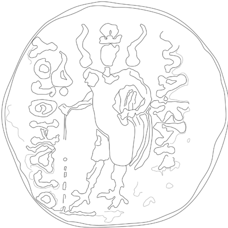
FIGURE 11 Outline of the reverse of a coin issued by “Hyrkōdes” with therianthrope being

DRAWING: M. MINARDI FROM A PHOTO BY O. BOPEARACHCHI