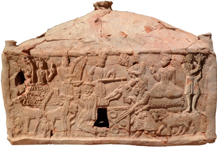
FIGURE 3 Fragment of a Sogdian ossuary from Shahr-i Sabz, 7th/8th century AD

attendants at his sides carrying fly swatters, tools that could allude to his function of repeller of demons (in this case the demon of the fly of the corpses). Another image, a painting from Pendzhikent (fig. 4), 6 shows the golden statue of a god carried in procession; the deity is represented holding an incense burner (similarly to the above-mentioned Samarkand ossuary), and a mace, the weapon that is mentioned in Srōsh's Avestan hymns as the instrument he uses against the demons. The most original feature of this image is the book from which the statue seems to emerge. This is most probably an illustration of one of the epithets of Srōsh, tanu.manthra , which means "having the Sacred Word for body". If so, the book would be the earliest material evidence for the existence of the Avesta, the sacred book of the Zoroastrians.