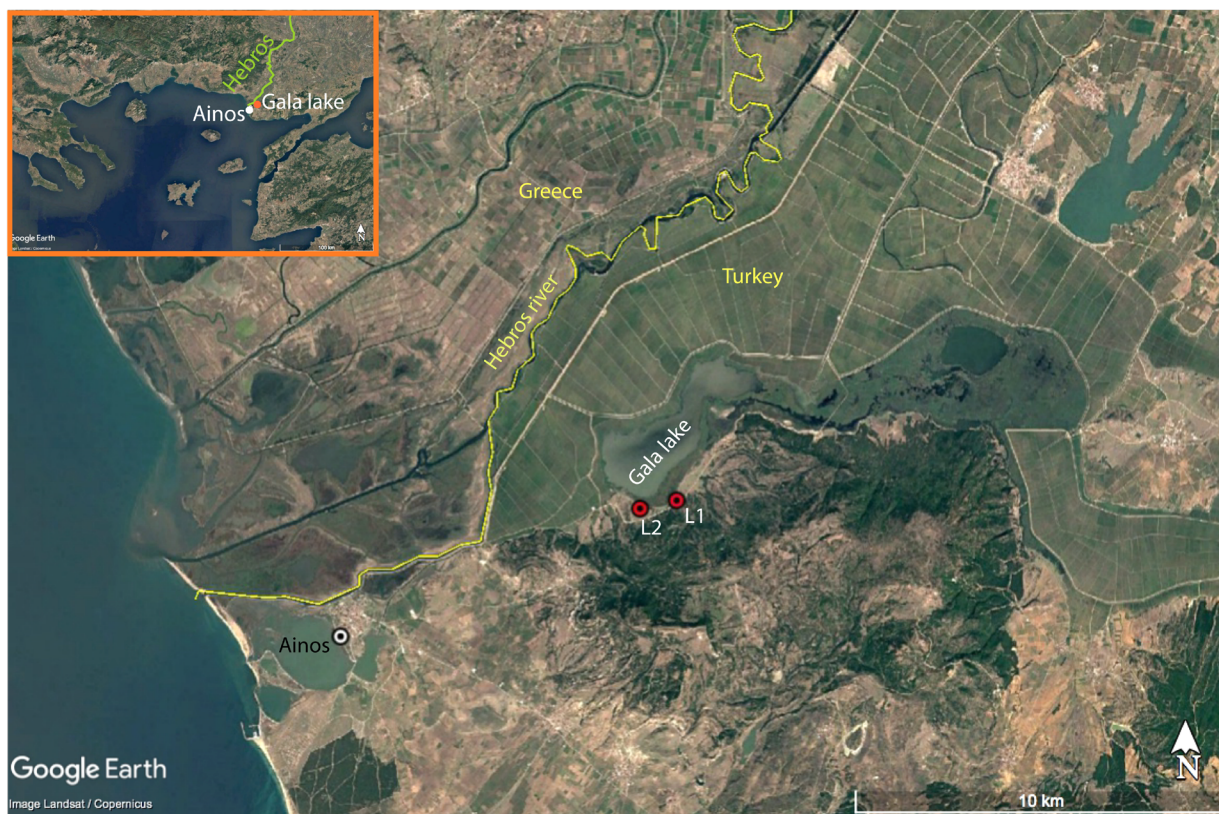
Fig. 1: Site location map of the investigation area on Lake Gala, Turkey.

Ferrex CON650, by Dr. Förster) was installed on a manual cart. The probes were mounted at intervals of 0.5 m, so that each parallel profile covered a 2 m width. In-line, measurements were taken every 5 cm. The ERT mapping was carried out with the RESECS-Multielectrode-System. A total of 23 electrical profiles, each of them 32 m long, were measured with the configurations Dipole-Dipole and Wenner. The distance between electrodes and parallel profiles was of 1 m. The pseudosections were inverted in 2D using the open-source software BERT (Günther and Rückner 2015). For the GPR, a single-channel instrument, SIR 4000 by GSSI, was used with a dual frequency antenna, including the main frequency bands of 300 MHz and 800 MHz. The profile spacing was 0.3 m and a scan was recorded in-line approximately every 2 cm.