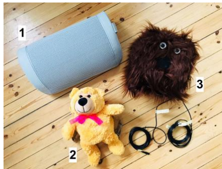
Figure 1 – The Haptic Music Players (HMPs) used in the study: HMP 1) a haptic pillow, HMP 2) a plush toy backpack with an embedded haptic strap, and HMP 3) a custom-built plush toy with embedded tactile transducer and full-range speaker 17

HMP 1, the HUMU Augmented Audio Cushion, is displayed in Figure 1. The HUMU pillow has an embedded vibrating sound board assembly, with a sound and vibration frequency response of 20-20 000 Hz. It plays music in stereo. We connected the HUMU pillow using Bluetooth, but it also has a 3.5mm jack connection. Based on the meeting described in Section 3.1.1, we concluded that the cushion might not need to be modified to fit the needs of the students. There was no need for an additional layer of padded protection for this device since it did not break when we threw it to the floor for testing purposes.