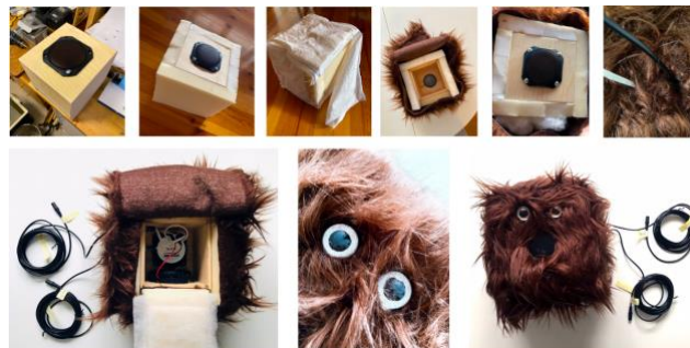
Figure 3 – HMP 3 at different stages of the development process