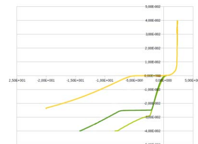
Figure 3. I(V) curves obtained. Yellow: PV cell in obscurity. Dark green: PV cell without graphene under lighting. Light green: PV cell with graphene under lighting.