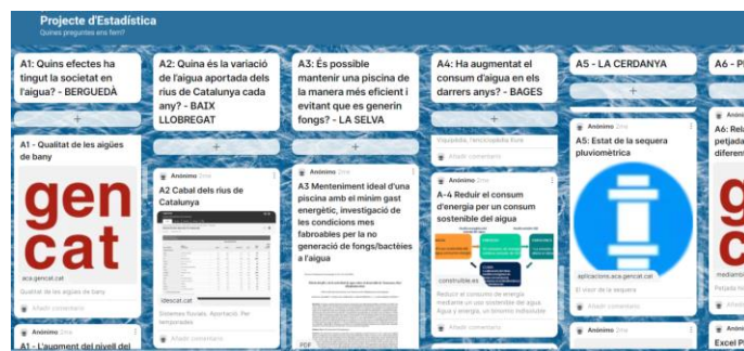
Figure 2. Padlet with the gathered information, data and project proposals