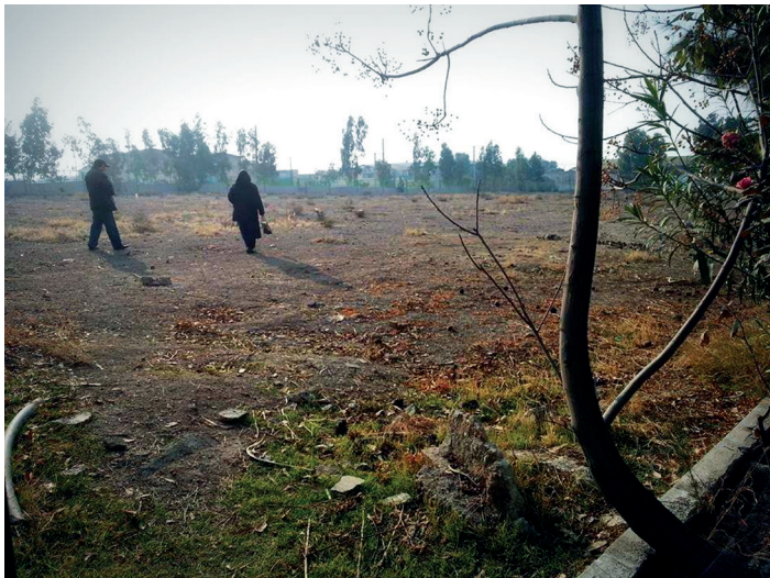
Fig. 2: Khàvaràn, unknown photographer, unknown date.