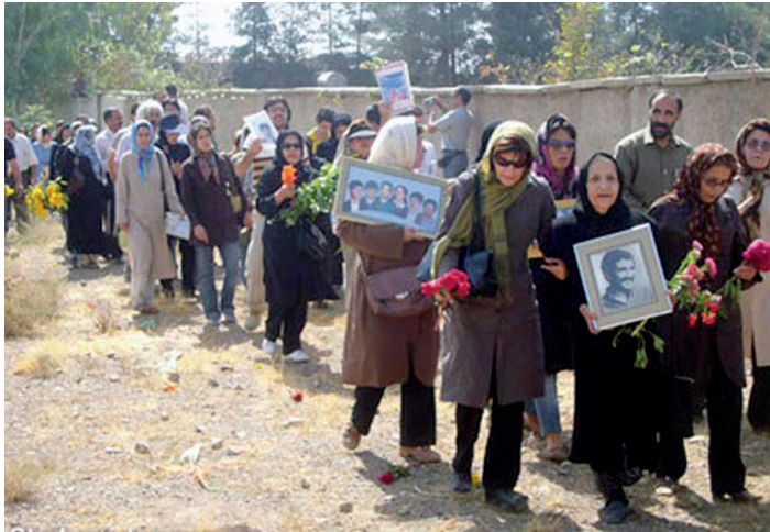
Fig. 1: Khàvaràn, a gathering of the families of the left-wing militants executed during the 1980s, pictures taken in the mid-2000s.