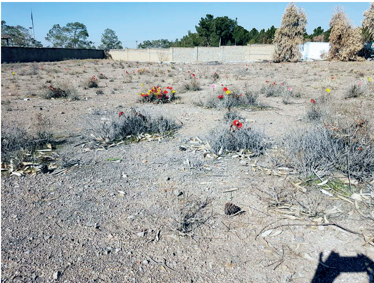
Figs 3 & 4: Khàvaràn, unknown photographer, unknown date.