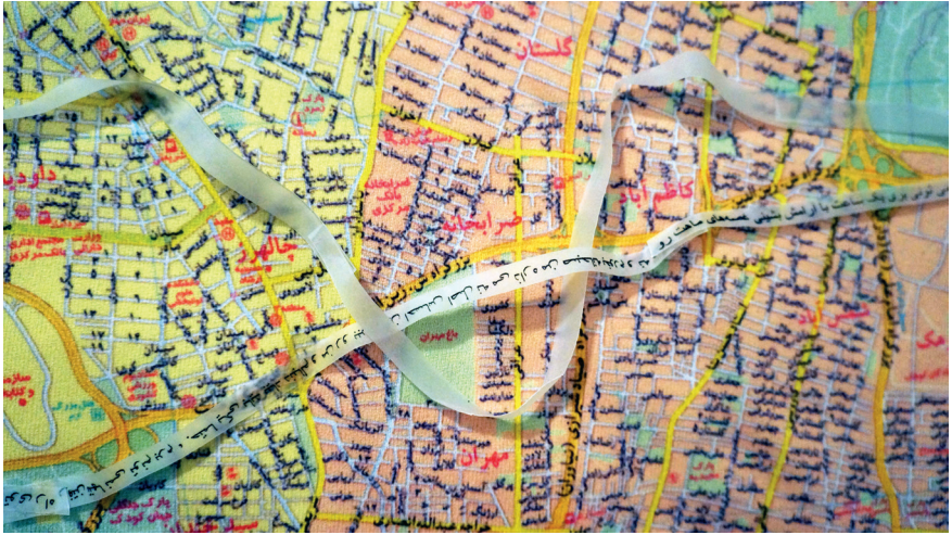
Fig. 7: Bahar Majdzadeh: Detailed Map of the Invisibles , 2019.

close friends and relatives. The past is not entirely kept in the individual memory, which only retains impressions, fragments, images that cannot alone constitute the whole memory. Collective representations constitute the memory of the event. Halbwachs does not totally reject the concept of individual memory. The collective memory, as he writes, covers the individual memories, but must not be confused with them. 17 It is the lived memory of a social group, a society. Each group has a memory and its length is limited to the group's lifetime. (Fig. 7) Art can be a place of refuge for a collective memory of a political nature. By integrating it into an aesthetic framework, one perceivable with the senses, the artist becomes a transmitter of this memory and gives a new visibility to the symptoms of the psychosocial trauma. The use of this concept in my artwork enables a representation of what has been made invisible and allows a space of appearance to be produced within a sensory space for the executed militants. The bàzmànde-gàn bring the militants' memory into the center of the urban space, where those in power had expelled them from. They bring with them the phantoms of Khàvaràn every time they go back to the city and leave behind them, all along the way, a trace of the specter. The comings and goings of the families to Khàvaràn have, in a way, moved this forgotten place closer to Tehran, which, from a temporal point of view, it had been moved away from.