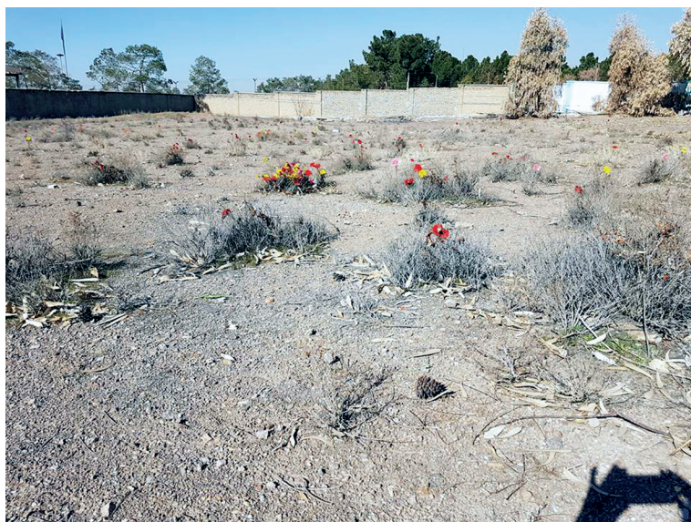
Figs 3 & 4: Khàvaràn, unknown photographer, unknown date.