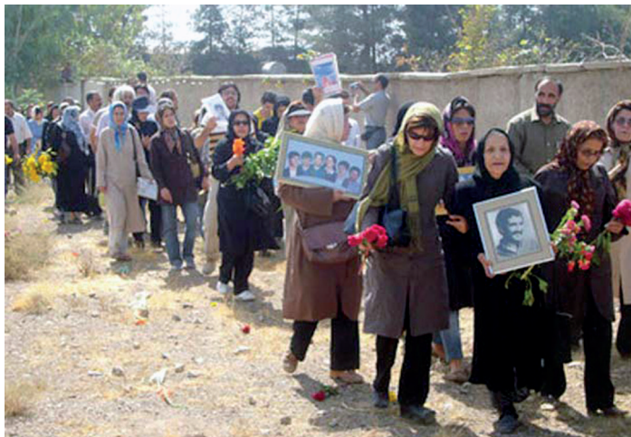
Fig. 1: Khàvaràn, a gathering of the families of the left-wing militants executed during the 1980s, unknown photographer, pictures taken in the mid-2000s.