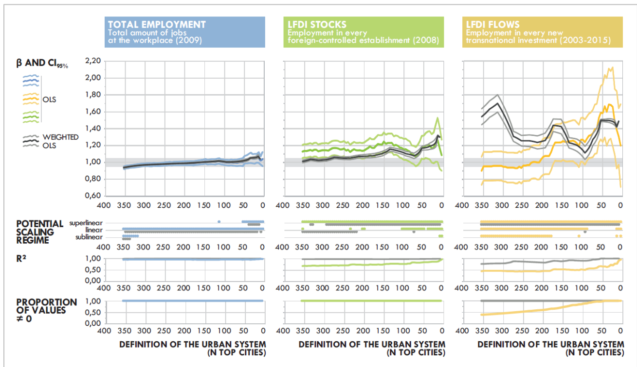
FIGURE 2. TOTAL EMPLOYMENT, LFDI STOCKS AND LFDI FLOWS VERSUS POPULATION THROUGH OLS AND WEIGHTED OLS APPROACHES: SENSITIVITY ANALYSIS ACCORDING TO THE SIZE OF THE URBAN SYSTEM UNDER CONSIDERATION

Results of both regressions are shown in Figure 2, in color for the OLS regression, in grey for the weighted one.