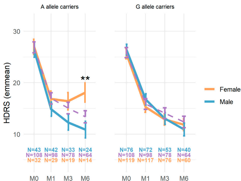
Figure 1. HDRS scores according to sex and MAOA rs979605 genotypes. Model estimates of the HDRS score (y-axis) at different study time points (x-axis) for MAOA rs979605 A allele female homozygotes (orange), female heterozygotes (purple dashed), and male carriers (blue). G allele carriers (right) are shown for comparison only. ** p < 0.01 following Bonferroni correction for the nine comparisons in A allele carriers. HDRS, 17-item Hamilton Depression Rating Scale.

[3.03–11.38], p = 0.0067 ) (see Figure 1). No other allele-specific associations with the HDRS score were observed.