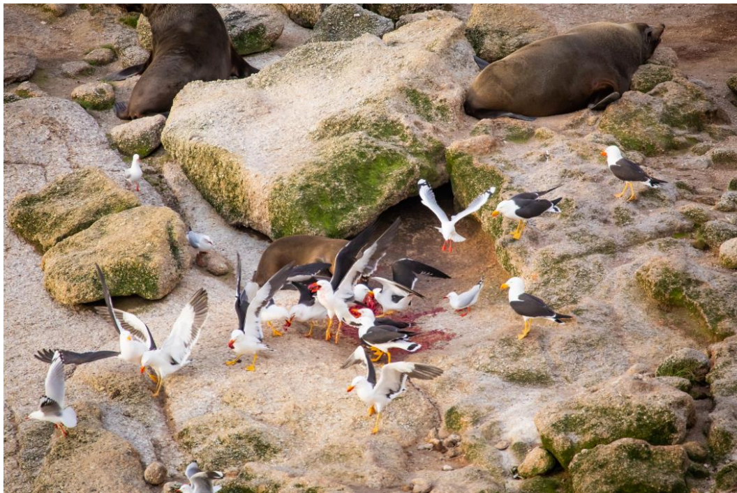
Figure 1. Pacific gulls scavenging an Australian fur seal placenta post-parturition.

The aim of this study was to determine if PGs could act as vectors of C. burnetii within the marine environment. Over the last decade, KI has been the focus of extensive AusFS research during the breeding season by some of the authors who have frequently observed that PGs scavenge freshly produced AusFS placental material (Figure 1). It was hypothesized, therefore, that they would acquire and act as vectors for this pathogen. Additionally, it was hypothesized that PGs breeding on Seal Island (SI), a nearby island where (despite the name) there is no AusFS breeding colony, would not have detectable C. burnetii . Considering that the role of birds in the epidemiology of C. burnetii is poorly understood [15], it is important to have a better grasp of the ecological role of the PG as a potential vector for spreading C. burnetii in marine mammal populations. Whether this pathogen could be a disease risk to the gulls themselves or pose a risk of being spread as a zoonotic infection are important considerations not investigated in this study.