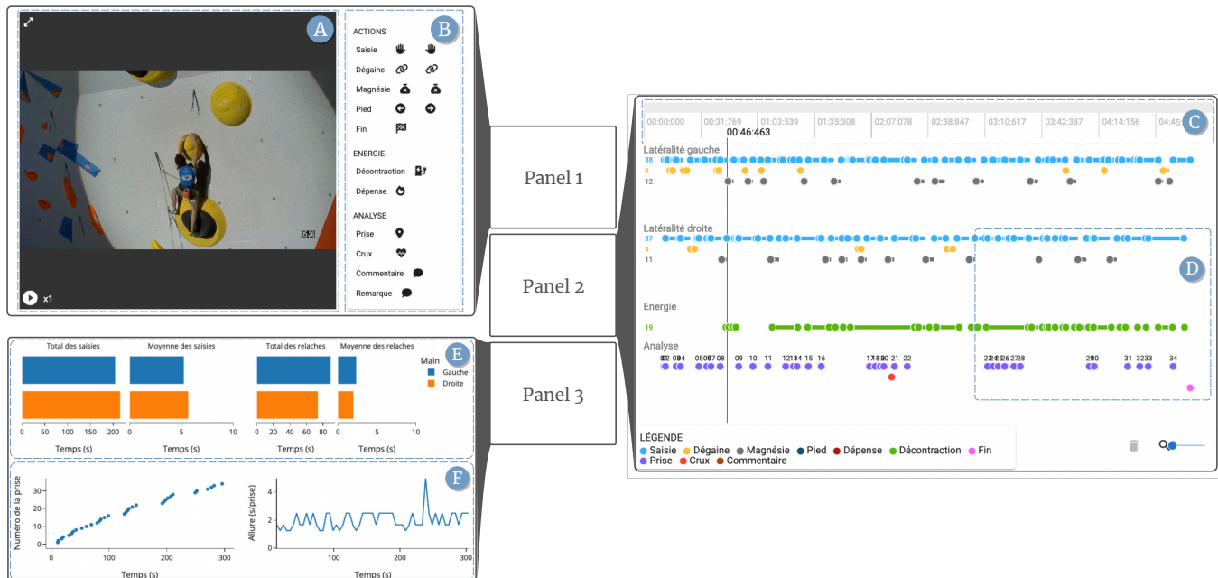
Figure 1: The tool consists of three panels: one to play the video stream and create annotations, a second to visualize them, and a third to summarize the quantitative information they represent. The first panel presents the performance video stream (a) and a sequencing panel to create annotations (b). The second panel displays the timeline (c) with annotations depicted as circles and lines that represent transient or lasting actions (d). The last panel presents plots that depict the cumulated or average holding and resting times for both hands (e), or the score evolution and climbing speed (f).

Univ. Lille, Inria, CNRS, Centrale Lille, UMR 9189 CRISTAL Lille, France