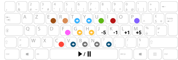
Figure 3: Keyboard shortcuts for creating annotations and controlling time in the video based on the analyst requirements.

After the trainer and analyst gained experience with the tool, discussions led to creating annotations for the feet (blue dot) (see Figure 2). The analyst annotated this information on several videos and remarked it required significantly more time to completely annotate