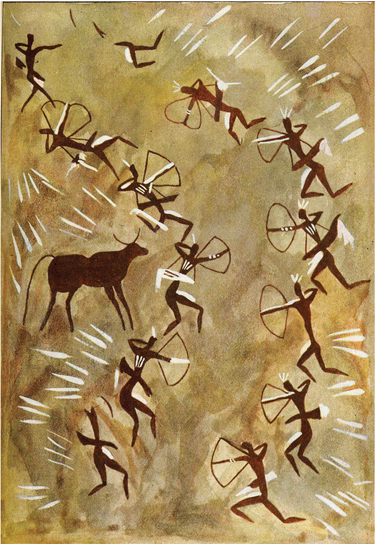
Fig. 3 – Drawing of a Mid- to Late-Holocene rock art scene with two confronting groups, Karkur et-Talh, Jebel el-'Uweināt (Almásy, 1936: plate VII).

Fig. 3 – Aquarelle (sans échelle) d'une scène d'art rupestre de l'Holocène moyen à récent avec deux groupes en confrontation, Karkur et-Talh, Jebel el-'Uweināt (Almásy, 1936 : planche VII).