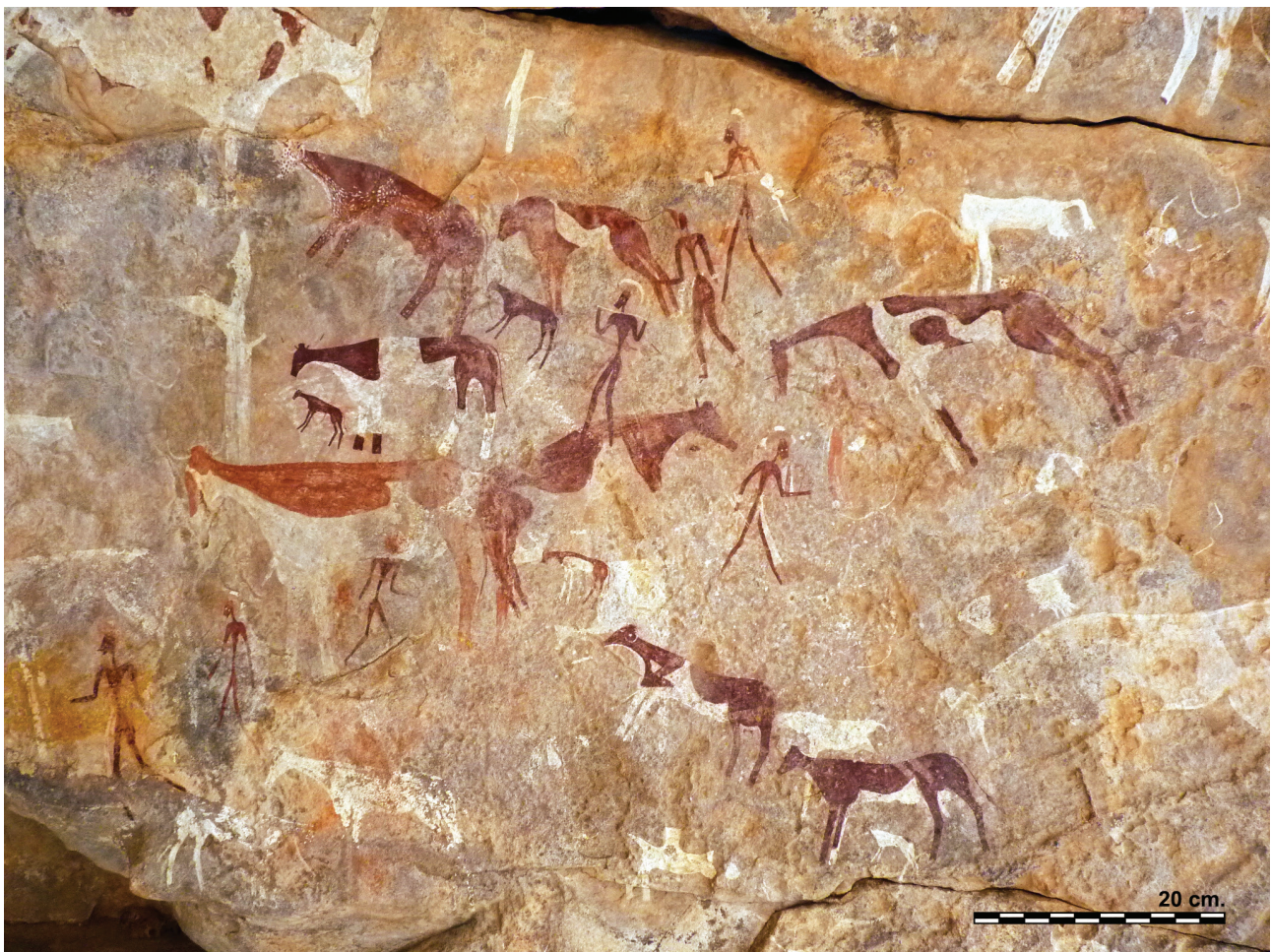
Fig. 2 – Rock art panel displaying cattle herds of large size, Late Neolithic, Peter and Paul massif.

Although it is notoriously difficult to precisely date rock art, it seems that the repertoire of Saharan rock art representations underwent a radical shift with the onset of pastoralism. Cattle became the quasi-monopolistic subject of most depictions (fig. 2). Relations to cattle seem to become central in the ideal world. Hybrid creatures and “transmorphic beings” disappear from the repertoire at the same moment, overcome by this “cattle invasion” (Honoré, 2021). With the onset of pastoralism, the rock art record seems to evidence an ontological revolution, a profound change in the way prehistoric groups view the world and interact within it. It is also remarkable that, while domesticated ovicaprines and bovines were adopted roughly at the same moment and are evidenced together on many sites, bovines obviously had prevalence in terms of rock art depictions and animal burials. Symbolic aspects and social importance seem to be closely connected with cattle more than with ovicaprines. Equally important as the cattle figure, herds are frequently depicted, sometimes with a very important number of livestock. Early pastoralist practises might thus have been non-commensurate to group’s food needs – one of the elements defining the “African cattle complex”.