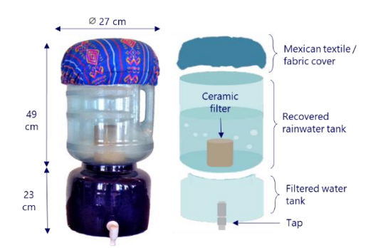
Figure 1. The Ceramic Filter

The water crisis in central Mexico was the trigger for Caminos de Agua to begin experimenting with appropriate technologies focused on water filtration and purification. In collaboration with universities and local communities, Caminos de Agua has developed. The filter developed by Caminos de Agua is a clear example of frugal innovation at the BoP (Fig. 1).