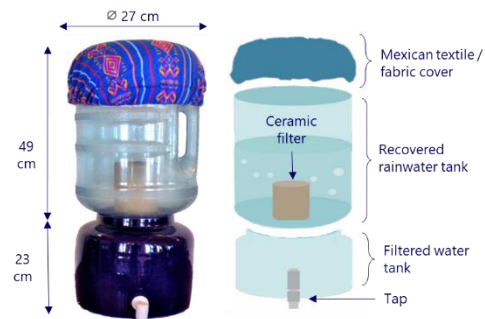
Figure 1. The Ceramic Filter

The water crisis in central Mexico was the trigger for Caminos de Agua to begin experimenting with appropriate technologies focused on water filtration and purification. In collaboration with universities and local communities, Caminos de Agua has developed. The filter developed by Caminos de Agua is a clear example of frugal innovation at the BoP (Fig. 1).