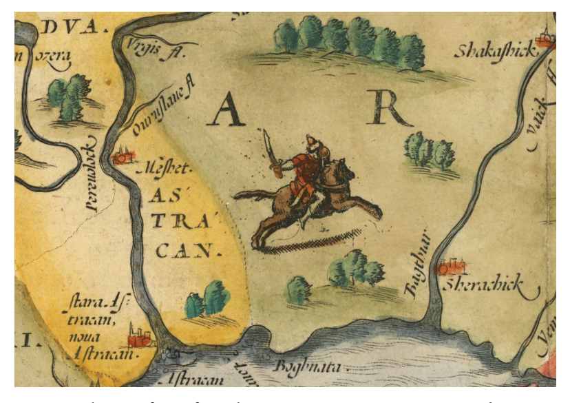
Fig. 2. Close-up of part of map shown in Figure 1.

geographical echoes of competing Russian and Tatar cities and histories. The most extreme example in this respect is the passage of Jenkinson's arrival in a newly conquered Astrakhan, where it becomes particularly difficult to tell old from new, ruin from stronghold, Tatar from Russian: