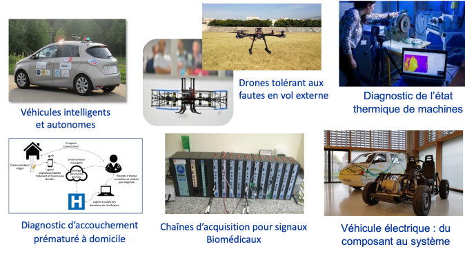
Figure 2. Technological platforms supporting IRP ADONIS research work