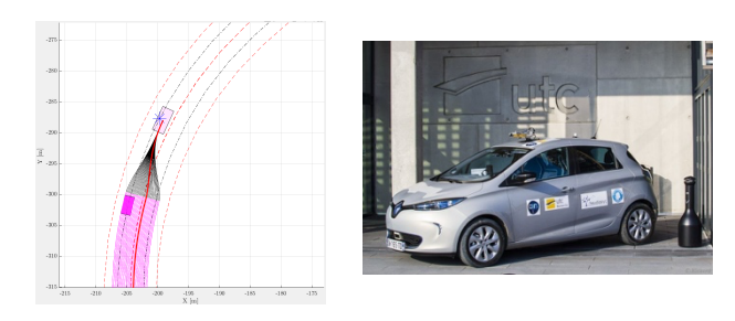
Figure 4. Application around autonomous electric vehicles

In addition, themes around electrical machines, batteries and power electronic systems are studied between the Roberval laboratory and UL, including: