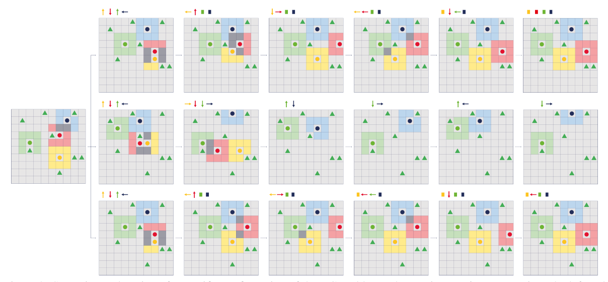
Figure 3: Scenario-Explanation of a specific configuration of the DC problem. The starting configuration A is at the left and the three lines correspond respectively to the FE-scenario, HE-scenario and P-scenario.