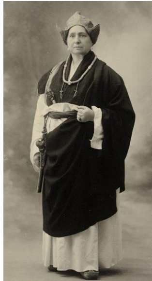
Figure1: Alexandra David Néel

To travel disguised as locals is paradigmatic to the orientalist approach. It emphasizes the exotic other and the position of the European observer as a cultural spy by hiding who she is for getting more information. On my view, this dissimulation is a paradigmatic status of a colonial view. The postcolonial approach is totally contrary to this disguised and hidden agenda. No academic, after the sixties, would ever take this position, but we must recall that she travelled in Tibet during the first decades of the twentieth century. She arrived in Lhasa in 1924. It is important to underline this historical dimension. It is obvious that she is situated in the logical continuity of the tales and stories given by the French Missionaries in 1846. Even the ways she disguised herself can be inspired by the stories of travels of Huc and Gabet. They also dressed up as Tibetan Lamas when travelling to China, Mongolia and Tibet. These authors recall in their book the urge to change clothes. There are continuities between Huc and Gabet (1) and Alexandra David Neel's Voyage d'une Parisienne à Lhasa , published in Paris, London and New York in 1927.