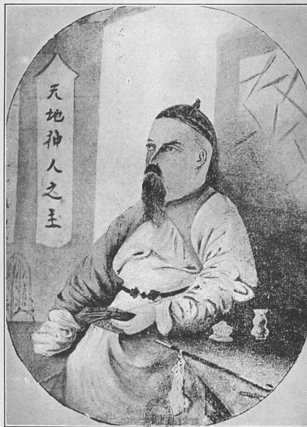
LE R. P. HUC EN COSTUME CHINOIS

France. We put on a long yellow robe, fastened at the right side with five gilt buttons, and round the waist by a long red sash; over this was a red jacket, with a collar of purple velvet; a yellow cap, surmounted by a red tuft, completed our new costume. Breakfast followed this decisive operation, but it was silent and sad. When the Comptroller of the Chest brought in some glasses and an urn, wherein smoked the hot wine drunk by the Chinese, we told him that having changed our habit of dress, we should change also our habit of living. "Take away," said we, "that wine and that chafing dish; henceforth we renounce drinking and smoking. You know," added we, laughing, "that good Lamas abstain from wine and tobacco." The Chinese Christians who surrounded us did not join in the laugh; they looked at us without speaking and with deep commiseration, fully persuaded that we should inevitably perish of privation and misery in the deserts of Tartary" 1