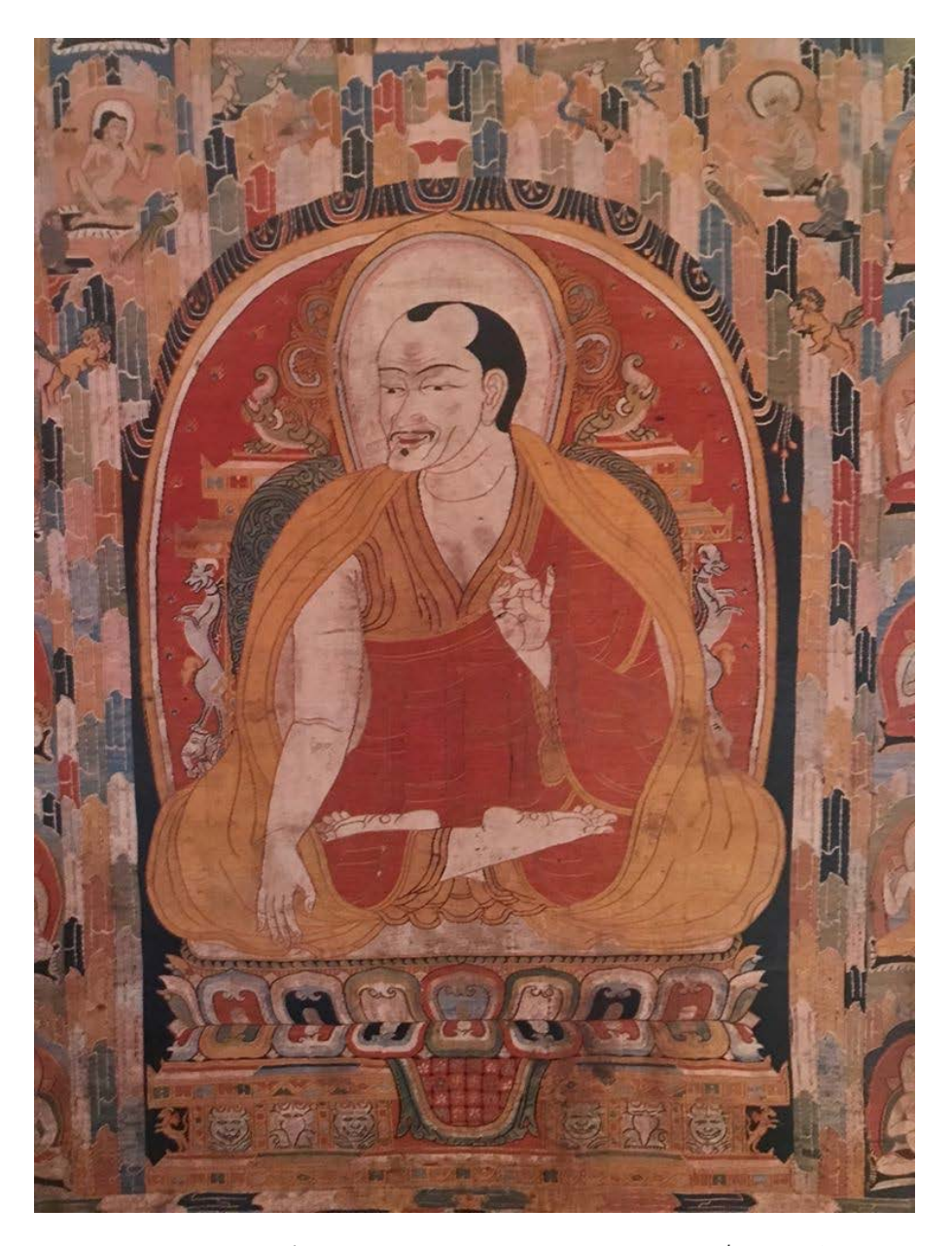
Figure 3. Portrait of Lama Zhang, silk tapestry, dimensions, 84 \times 54 cm., 13^{th} century (based on an earlier Tibetan thangka), collection of the Potala Palace.