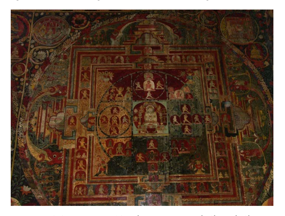
Figure 5. Detail of a Vairocana Maṇḍala, 13th century, Byang ma lha khang, Lha khang chen mo, Sa skya Monastery, photograph by the author, 2004.