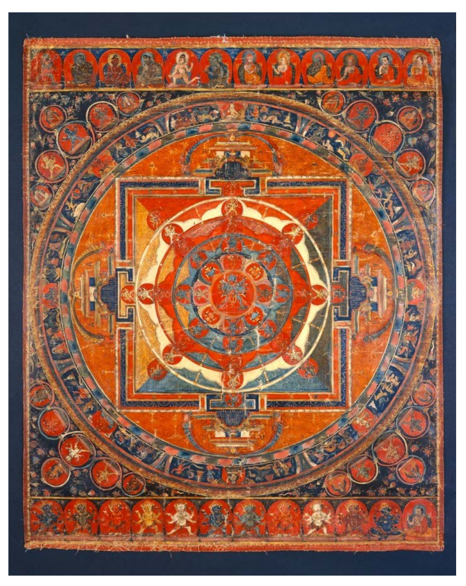
Figure 1. Cakrasaṃvara Maṇḍala, pigments on cotton, 65 \times 52.7 cm. Tibet, 13th century, private collection.