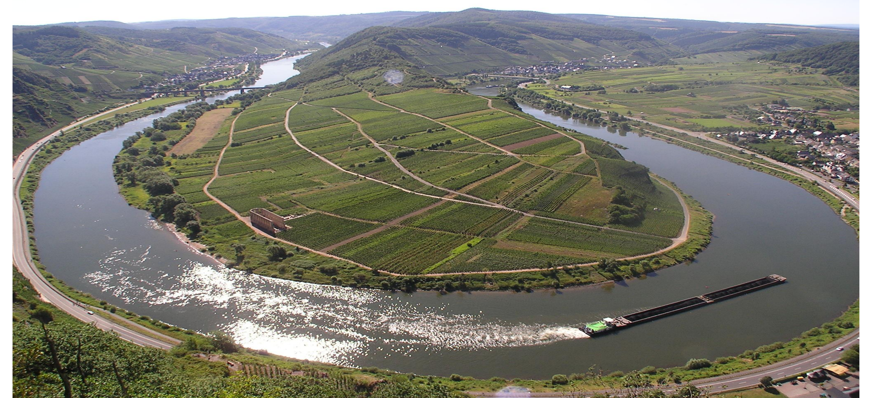
Moselle river by Axel Mauruszat (source Wikimedia Commons).

The figure below develops the relation between the bioavailability of a substance represented by its Koc and the effect of measured TOC on QS SED extrapolation. Each blue spot represents the ratio of a QS SED obtained with measured TOC and the default QS SED (with TOC = 5%). The exercise was realized on seven compounds with an expected increasing bioavailability 2 .