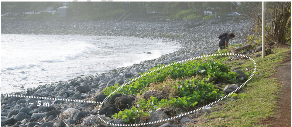
Fig. 3. Epigrapsus politus Heller, 1862 biotope at Réunion Is. (Manapany-Les-Bains). The crab was observed exclusively inside the dotted oval line, about 5 m away from the highest sea level, in a place with pebbles covered with creeping vine Convolvulaceae, Ipomoea pes-caprae (L.) R. Br., 1818, and grass.