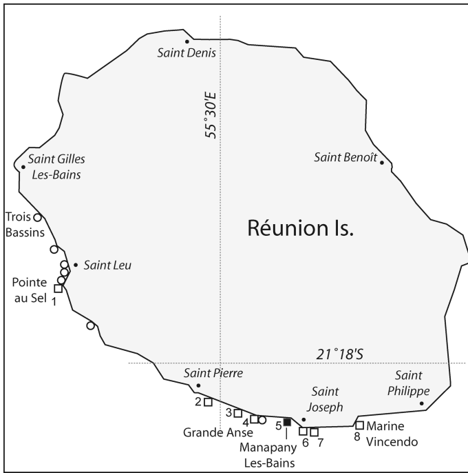
Fig. 1. Places prospected for Epigrapsus crabs around La Réunion in 2008 (white circles, unnumbered) and 2019 (squares, 1 to 8). Epigrapsus politus Heller, 1862 was found only at Manapany-Les-Bains (black square, 5).

specimens were collected for morphological observations: 1 male 13.7 \times 16.2 mm (carapace length \times CW) (fig. 2), and 1 female 15.3 \times 18.7 mm. After observations and macro photographs, they have been deposited and registered in the collection of the Muséum national d'Histoire naturelle, Paris (MNHN-IU-2013-7280).