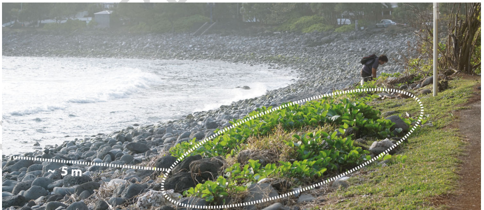
Fig. 3. Epigrapsus politus Heller, 1862 biotope at Réunion Is. (Manapany-Les-Bains). The crab was observed exclusively inside the dotted oval line, about 5 m away from the highest sea level, in a place with pebbles covered with creeping vine Convolvulaceae, Ipomoea pes-caprae (L.) R. Br., 1818, and grass.