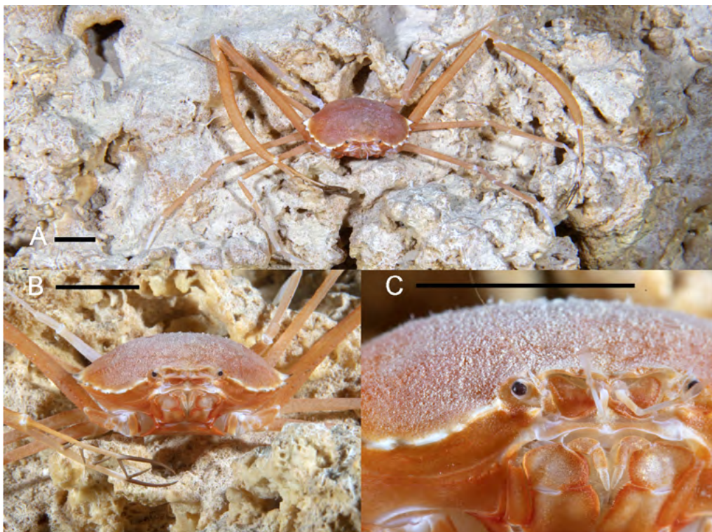
Figure 2. Atoportunus dolichopus in the cave at 75m depth at Mayotte Island, 23/02/2019. A) Defensive posture on hard substrate; B) Frontal view of carapace and aspect of right chela; C) Close-up frontal view showing orbits, epistome and buccal cavity. Estimated CB - 28mm. Scales bars - 10mm. Photographs G. Barathieu.

The eyes of Atoportunus crabs are reduced which is indicative of obligate cavernicolous species (Guinot, 1988; Ng and Takeda, 2003). In some cavernicolous crabs of the Potamidae, the reduction is so pronounced that the cornea is no longer visible (Guinot, 1988, Figs. 7-8). In the crabs examined from Mayotte, the cornea is still present but it is distinctly narrower than the ocular peduncle (Fig. 2C). Such a reduction is common in cavernicolous crabs. It has been documented recently by Wowor and Ng (2018) for three cavernicolous sesarmid of the genus Karstarma .