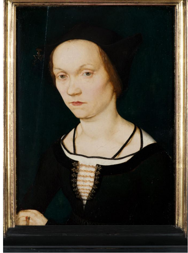
Hans Holbein the Elder's "Portrait of a woman"

If we are able to understand Cranach's painting today, it is thanks to extraneous knowledge available in books and in other domains, a key that is entirely missing for the Lascaux murals. The modern art criticised on post-its at the Tate , then, is not breaking with but honouring an ancient tradition.