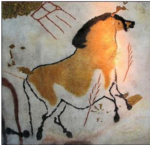
The Lascaux horse, with abstract signs around the front legs and above the horse

have been found). After the death of the story-teller, someone else would take his or her place and tell the same stories using the pictures and the signs as memogrammes. Until some day, for some reason, they stopped going and the cave was forgotten.