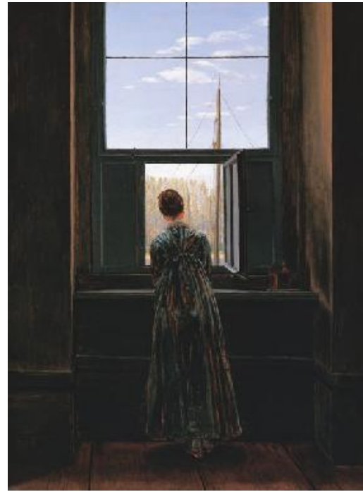
“Frau am Fenster”, Caspar David Friedrich