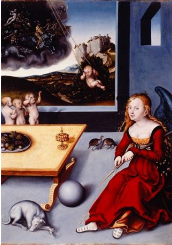
Lucas Cranach the Elder's "Melancholy"