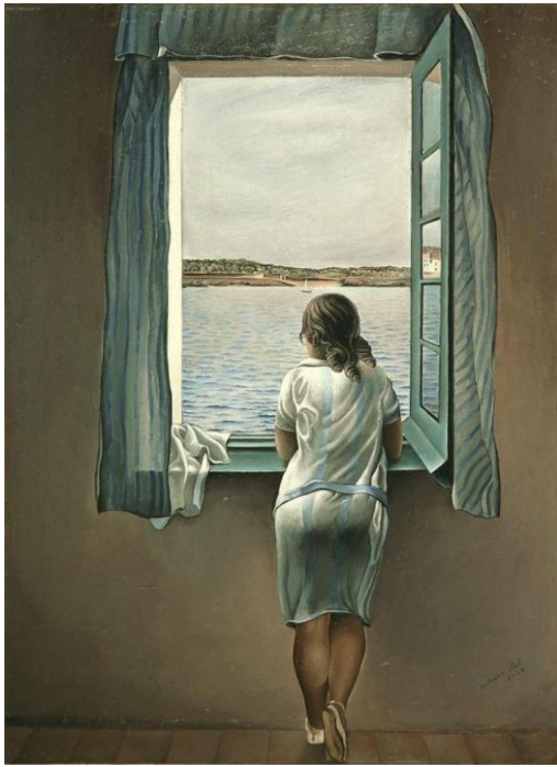
“Muchacha en la ventana”, Salvador Dali