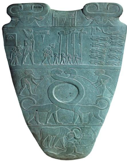
Palette of King Narmer, circa 3000 B.C.