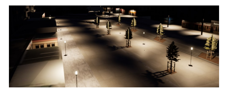
Fig. 1. A 3D environment simulated in virtual reality representing an existing large pedestrian street at night. Multiple parameters of the public lighting can be tested to analyse its impact on the feeling of safety.

Impact of Public Lighting Intensity on the Feeling of Safety in Virtual Reading/ISWC '22 Adjunct, September 11-15, 2022, Cambridge, United Kingdom