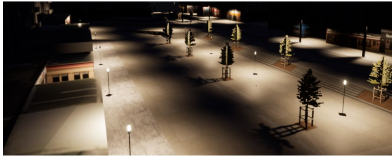
Fig. 1. A 3D environment simulated in virtual reality representing an existing large pedestrian street at night. Multiple parameters of the public lighting can be tested to analyse its impact on the feeling of safety.

More specifically, Maciejewski studied the influence of light temperature on the feeling of safety [Maciejewski 2018]. The researcher presented a 3D scene based on pictures to 10 participants. The scene is virtually separated in two parts (South and North), where each part was lit with a specific value of temperature (expressed in Kelvin) among three: 3000K, 5000K or 6500K. Each participant saw all combinations (six pairs) in a random order. The participants were asked to indicate each time if they felt more comfortable having to walk into the north or the south part. On average, the majority of participants preferred higher color temperature light.