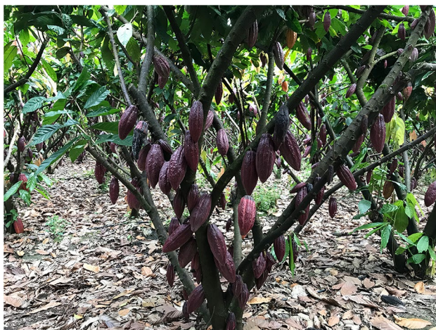
Fig. 1 Theobroma cacao .

Addressing current challenges to cacao production requires moving beyond the descriptive to the applied: optimizing the cacao root-associated microbiome to enhance the delivery of ecosystem services. Cacao agroforestry systems provide important regulating and supporting ecosystem services (Mortimer et al. 2018) in addition to valuable provisioning services for global consumers of chocolate. Less well understood is how specific breeding activities and management practices shape the potential of the cacao root-associated microbiome to deliver ecosystem