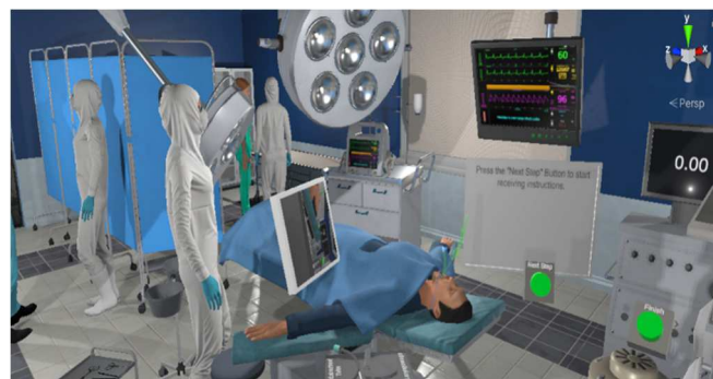
Fig. 1. Virtual surgical environment.

To collect physiological data we utilized the Empatica E4 wristband device. This device possesses PPG and EDA sensors, 3-axis Accelerometer, Infrared Thermopile, and Internal Real-Time Clock.