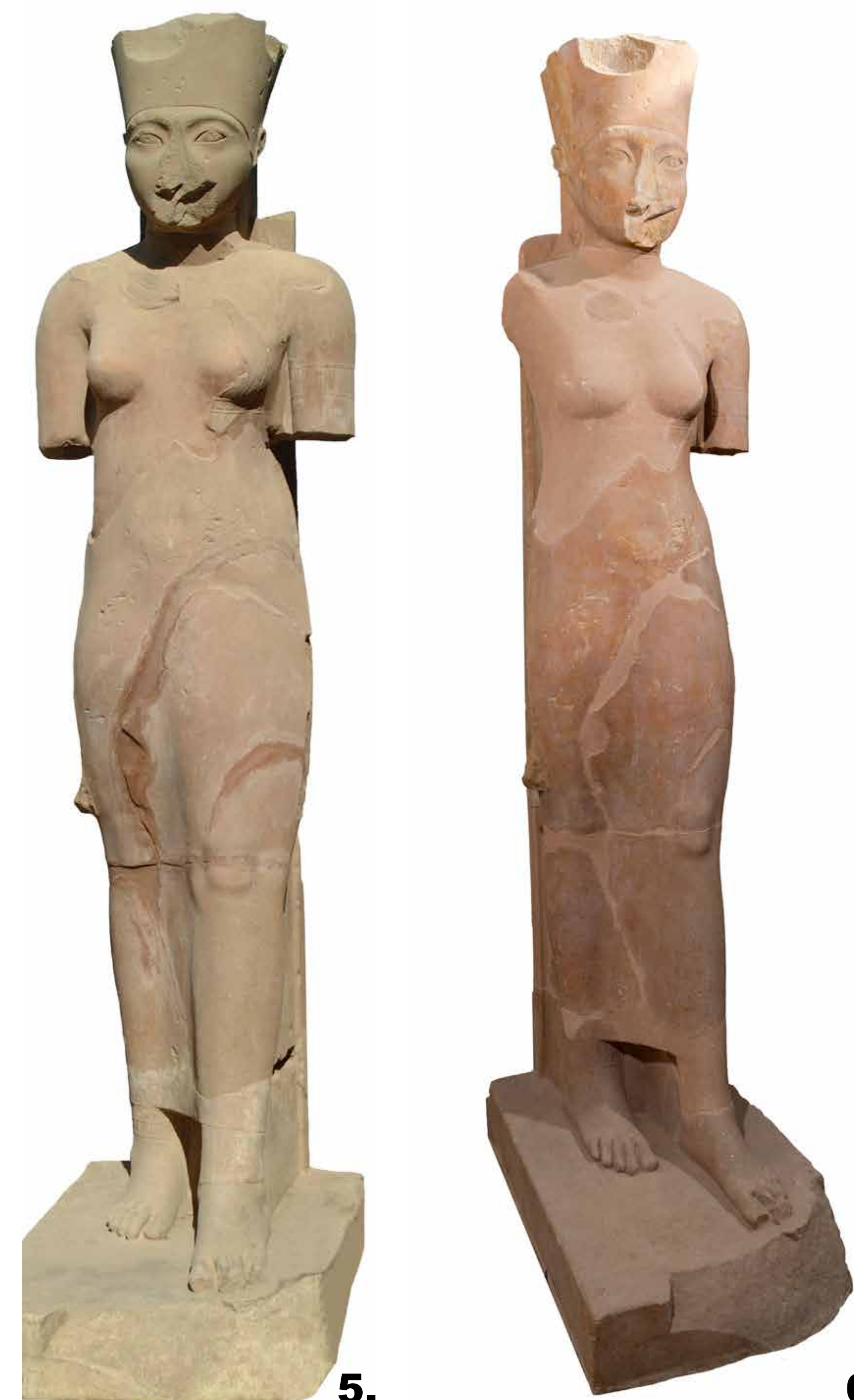
5. Statue of Amunet before restoration.