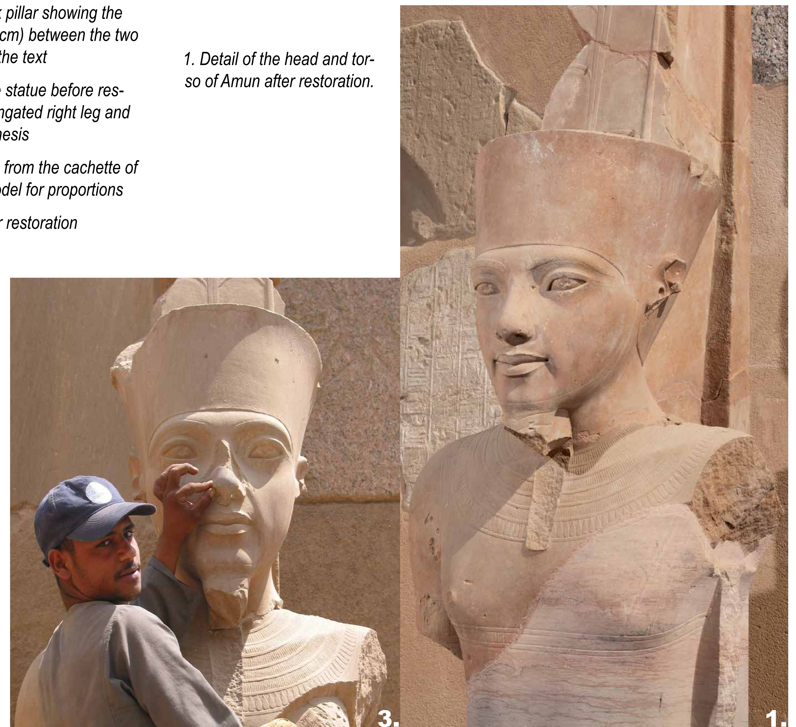
3. Fragment of the nose recovered in 2003.