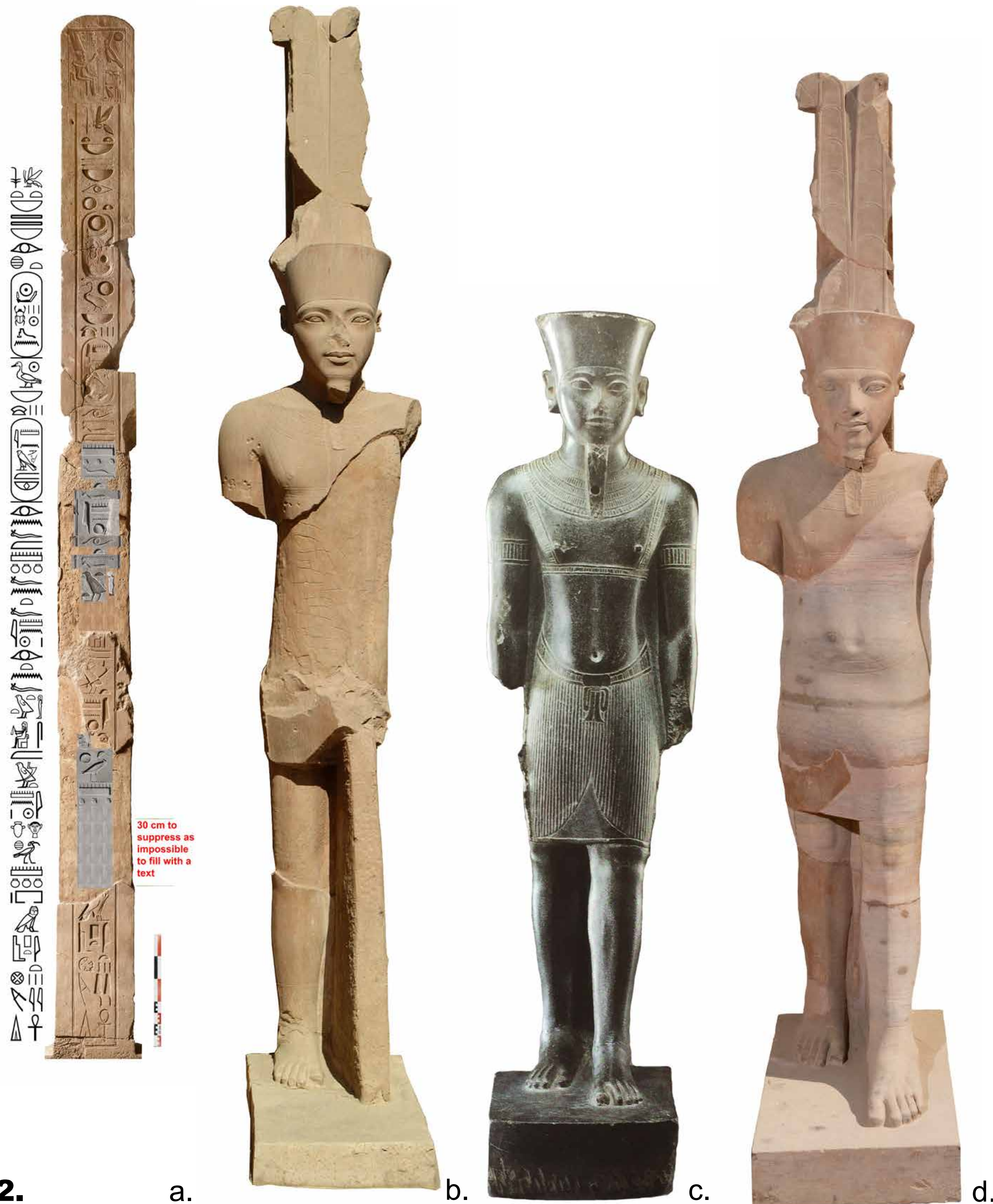
2a. Text of the back pillar showing the too long gap ( \approx 28 cm) between the two preserved parts of the text

Thus, the restoration of the statue consisted in a replica of the bust and of the left leg , adjusted on the proportions of the statue Cairo JE 38049, and hewn out an indurated sandstone very close to the original stone .