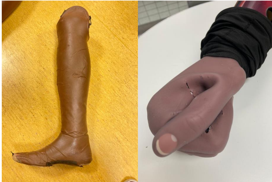
Figures 5 and 6: Lower and upper limb prostheses worn and damaged after months or years of use

Finally, the modalities of what it means to be living with a prosthesis are absent from media discourses: the issues regarding learning and actual use, the difficulties of using a prosthesis and the possibilities of non-use are never addressed in the collective representations. Passed over in silence, they become hard to anticipate for amputees entering the rehabilitation process; they might even prevent them from projecting themselves towards what awaits them in practice. This process wherein prosthetic devices are idealised and highly present in the media and cultural productions all the while amputees' bodies and experiences are absent, might lead to particular (high) expectations from future prosthetic 'users' (and their relatives), which may complicate the care journey.