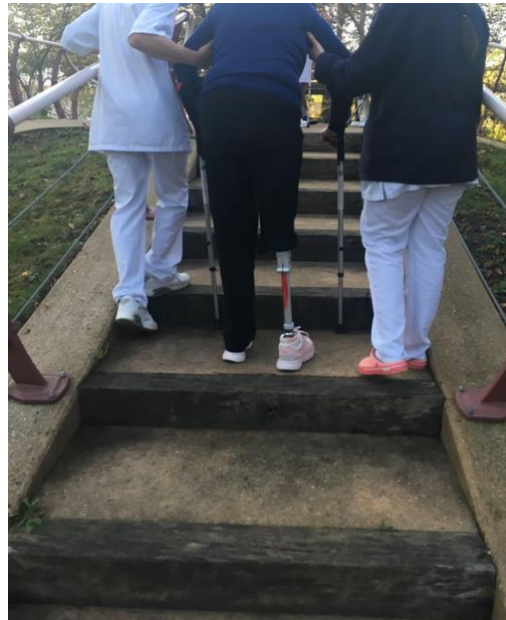
Figure 10 : Exercises, accompanied by caregivers, that consist in going up and down stairs and that are part of the accommodating process necessary to embody the prosthesis

In so doing, through increasing familiarity with the prosthesis, the embodiment process leads to a progressive blurring of the boundary between the organic (the body) and the material presence of the prosthetic device, that is, to an alliance between the two entities (Groud 2020; see also Oudshoorn 2020). Synonymous with embodiment and with a balance found between (subjective) absence and (material) presence, it is when motor behaviours and walking with the prosthesis become fluid and ‘natural’ that the body-prosthesis alliance is enacted: the materiality of the prosthesis and the amputated body becomes experienced as transparent