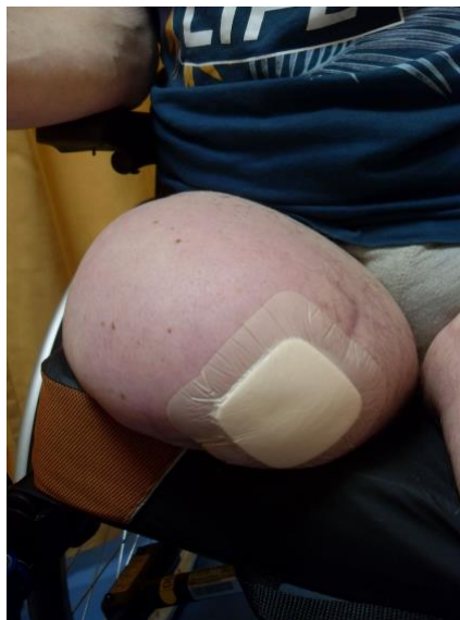
Figure 7: Dressing worn after a stump wound with the prosthetic socket

You have to explain that for some of them, it will be very quick, they will integrate it [the prosthesis] quickly and for others, well, there will be arteritis pain which means that they won't be able to keep it on for very long [...] [They won't be able to keep it] on the stump because it creates constraints in spite of everything (Emma, 26 years old, physiotherapist).