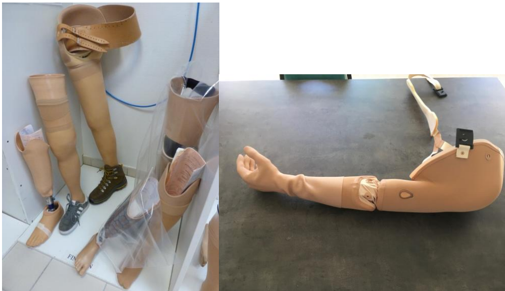
Figures 3 and 4: Lower and upper limb prostheses as they are delivered for a permanent use