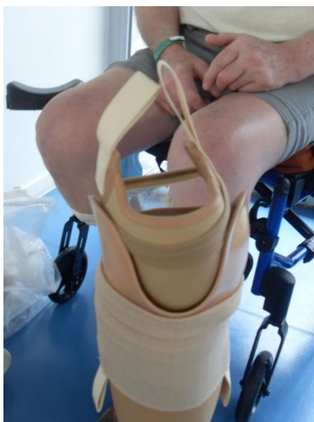
Figure 8: Prosthesis removed after 30 minutes of walking in rehabilitation centre

In the so-called prosthetic phase of rehabilitation, the accommodating process (Winance 2010) between body and prosthesis is therefore complex for most people. It fluctuates in a fragile balance between the search for progressive wear and periods of stoppage. Thus, if the prosthesis is materially present, and often within reach, it is nevertheless frequently absent, worn little or not at all during the days of re-education while waiting for an efficient entanglement between the organic and the prosthetic.