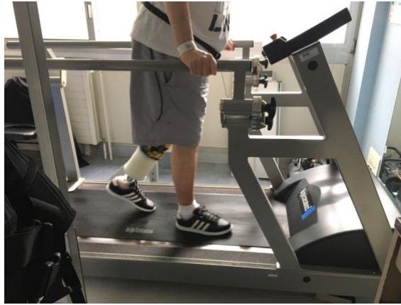
Figure 9: Exercises on a rehabilitation treadmill as part of the accommodating process necessary to embody the prosthesis