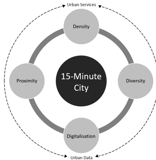
Figure 1. The 15-minute city framework as introduced by Moreno, Allam, Chabaud, Gall, and Pratlong [11].