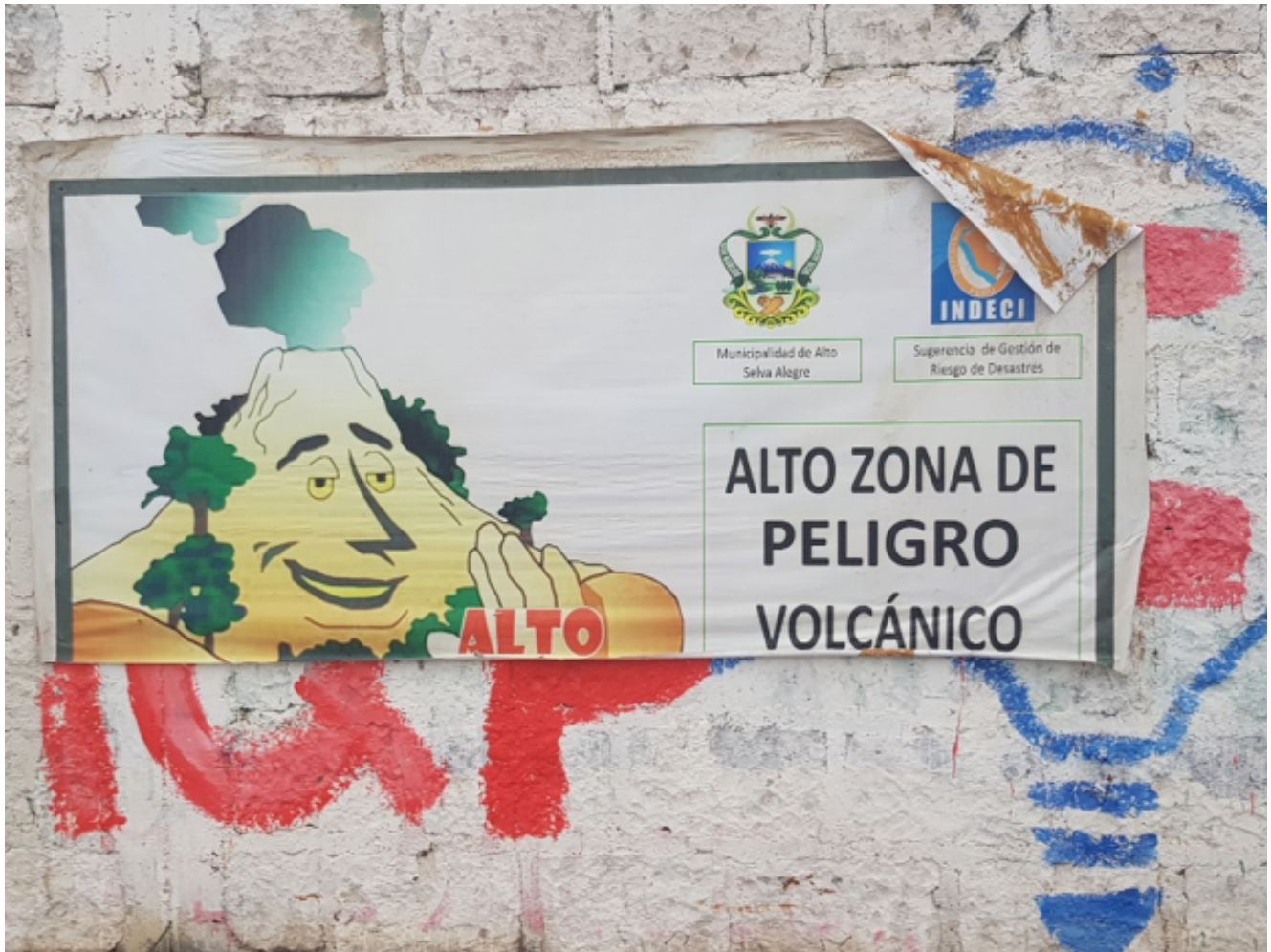
Figure 2: “Mr. Misti” taken down on the heights of Alto Selva Alegre, January 2020, photo credit: S. Rouquette.

tional channels of communication. These results may influence whether it is necessary to adapt volcanic risk communication methods to local populations.