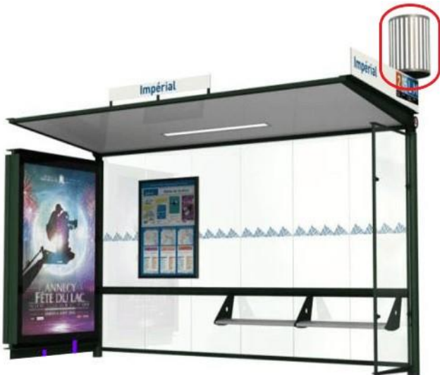
Figure 2. Small CELLS [2]

In the long term, the 5G network will use high frequencies, in the 26 GHz band (24.25 - 27.5 GHz). This is the so-called millimetre-wave band. It will make it possible to find bandwidth, which is essential for responding to the exponential growth in the number of connected objects, and to achieve speeds comparable to optical fibre. But, as their name suggests, millimetre waves have a notable drawback: a range of only a few hundred metres and difficulty in overcoming obstacles. The illustrative Figure 2.