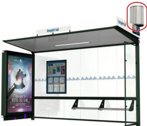
Figure 2. Small CELLS [2]

In the long term, the 5G network will use high frequencies, in the 26 GHz band (24.25 - 27.5 GHz). This is the so-called millimetre-wave band. It will make it possible to find bandwidth, which is essential for responding to the exponential growth in the number of connected objects, and to achieve speeds comparable to optical fibre. But, as their name suggests, millimetre waves have a notable drawback: a range of only a few hundred metres and difficulty in overcoming obstacles. The illustrative Figure 2.