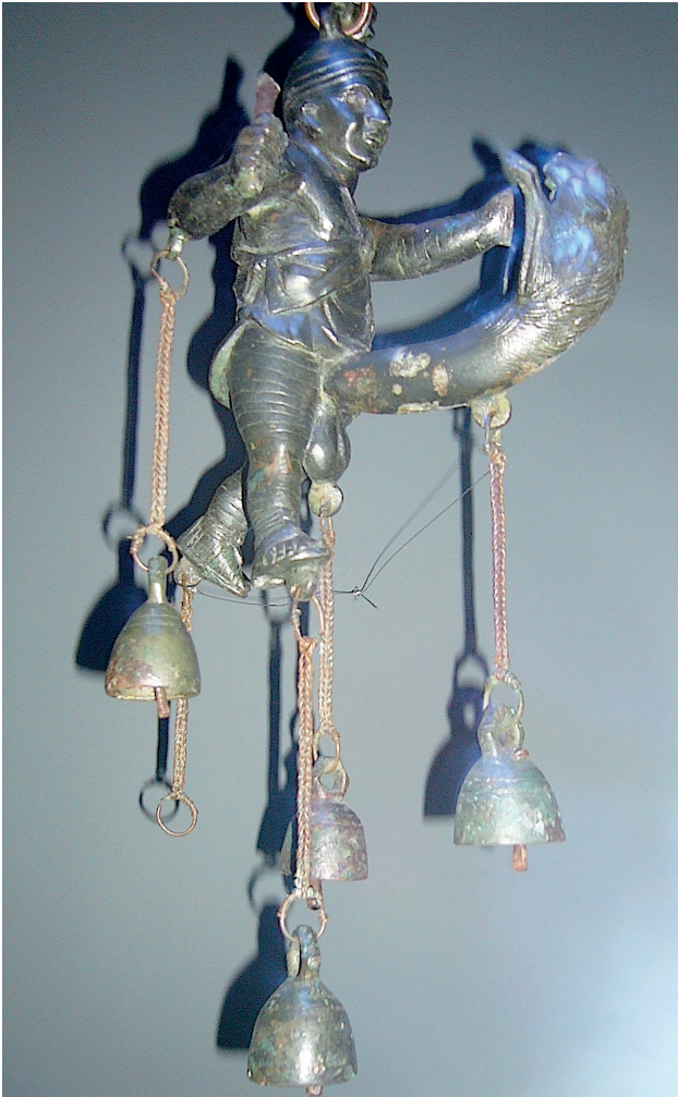
Fig. 5 : Gladiator tintinnabulum from Pompeii.