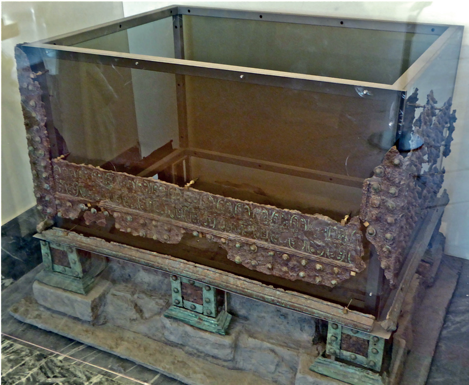
Fig. 2 : Remains of the strongbox from the south side of the atrium.