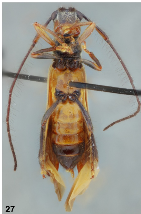
Figures 24-27. Hemilomecopterus alienus Martins & Galileo, 2004.

24. ♀ from Brazil, dorsal habitus. 25-27. ♂ from Ecuador. 25. Lateral habitus. 26. Dorsal habitus. 27. Ventral habitus.