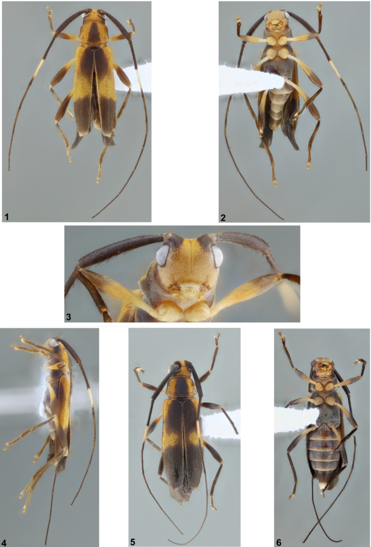
Figures 1-6. Piriana limai sp. nov.

1-4. Holotype ♂. 1. Dorsal habitus. 2. Ventral habitus. 3. Head, frontal view. 4. Lateral habitus. 5-6. Paratype ♀. 5. Dorsal habitus. 6. Ventral habitus.