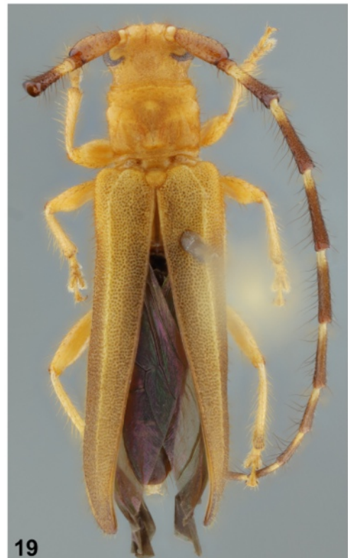
Figures 17-19. Cerambycidae spp., dorsal habitus.

17. Ozineus elongatus Bates, 1863, ♂. 18. Basiptera castaneipennis Thomson, 1864, ♀. 19. Dodecosis saperdina Bates, 1867, ♀.