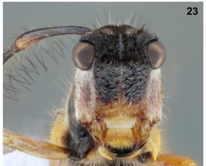
Figures 20-23. Hemilomecopterus alienus Martins & Galileo, 2004, ♀ from Brazil. 20. Ventral habitus. 21. Lateral habitus. 22. Head, lateral view. 23. Head, frontal view.