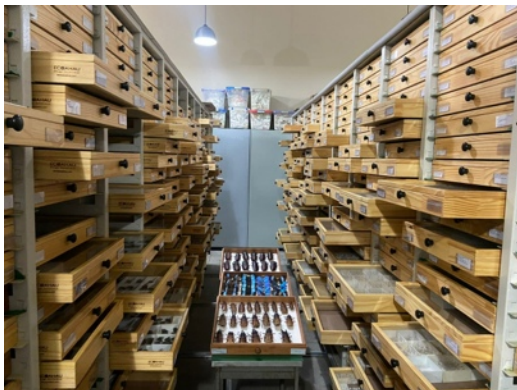
Illustration de la couverture :