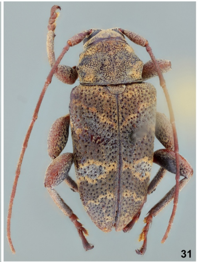
Figures 28-31. Lamiinae spp., dorsal habitus.

28. Iarucanga mimica (Bates, 1866), ♀ from Brazil (Acre). 29. Isomerida albicollis (Laporte, 1840), ♀ from Brazil (Acre). 30. Lycidola batesi Martins & Galileo, 1991, ♀ from Brazil (Acre). 31. Xenofrea durantoni Néouze & Tavakilian, 2005, ♂ from Brazil (Pará).