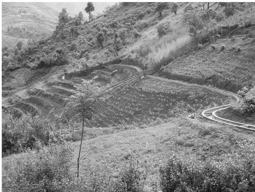
Figure 3.1 Diversity of crop system

the collective management of irrigation works, the principal characteristics of the system need to be presented. In light of this, it becomes apparent that the system relies on both a great autonomy and a strong interdependence of the users, therefore requiring precise coordination despite a lack of any formal organisation. According to the locality's communist party secretary, the highest post in the local political-administrative structure: