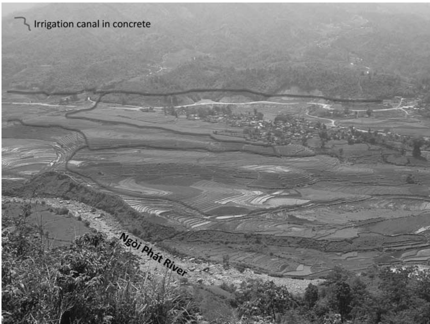
Figure 3.2 Water resources and irrigation system in Piềng Láo village

How is this autonomous system of irrigation management carried out in the locality studied? Irrigation depends on two types of aquatic sources: mountain springs and streams and the river Ngòi Phát which flows from southwest to northeast (see Figure 3.2). One single rice-producing area can be fed by several