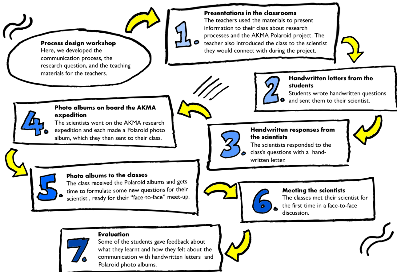
Figure 1. The process we followed during the AKMA Polaroid project, from the initial project development, through the communication activities, and ending with the evaluation questionnaire that the students filled out.