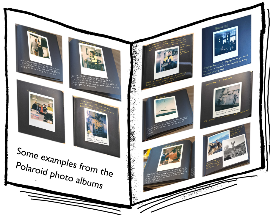
Figure 3. Some examples from the scientists' Polaroid photo albums that they made for the classes they interacted with. The photos are simply meant to give an idea of how the albums were constructed. The captions are not meant to be readable in the present setting.

our intermediate questions were a starting point for our analysis. However, we also analysed the data to find common insights within the students' answers, and in this way, we implemented an inductive approach, which let the data speak for themselves (Linneberg and Korsgaard, 2019).