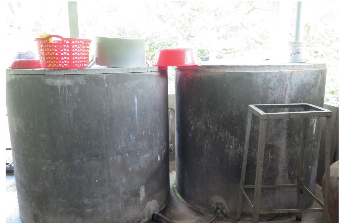
[Figure 11.11] Individual reservoir to stock rainwater Binh Dai district, Ben Tre

To respond to drought and salinization, local communities in our third case study (Ben Tre) have applied a number of short-term measures such as: switching from three to two rice seasons per year, or even to one season followed by a second season combining rice and shrimp farming; planting new drought/salt-resistant rice and fruit tree varieties; adopting new agriculture water-saving techniques (using water-fern to preserve soil moisture, applying drip irrigation systems, storing water in plastic socks placed at the bottom of ditches and furrows, see Figure 11.10), improving small-scale storage capacity for domestic water use (rainwater storage tanks from 10 m 3