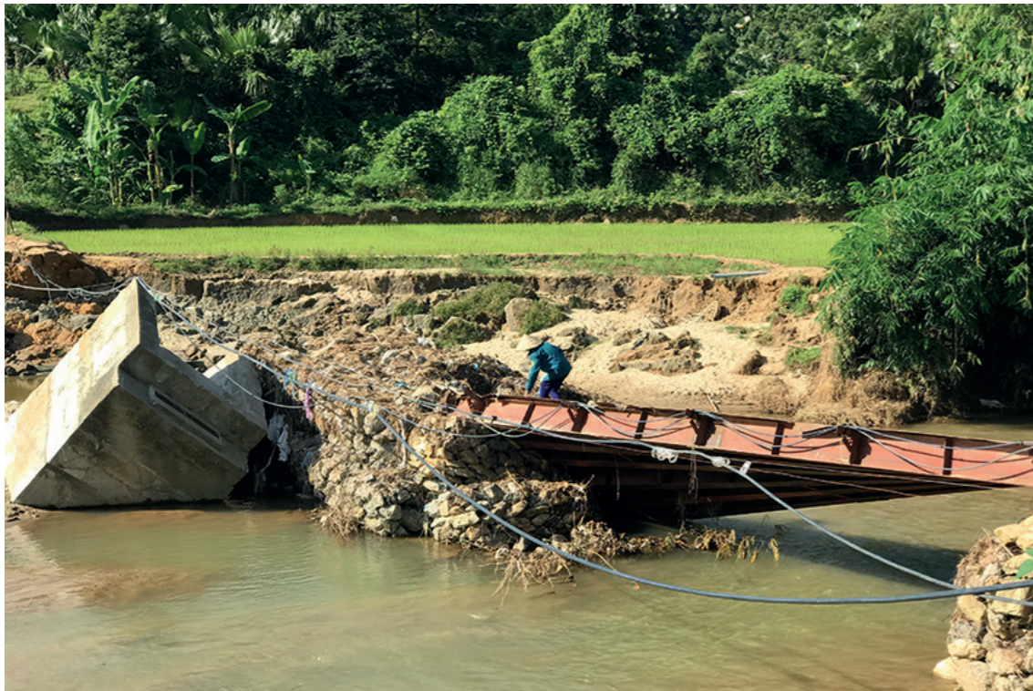
[Figure 11.4] Bridge destroyed by flash flood in November 2018

In November 2018, an unprecedented flash flood combined with a landslide devastated the commune. The flood affected 704 households and 222 houses, and destroyed many shops, roads and bridges [Figure 11.4], some sections of the irrigation system, w electric system and the water supply system, as well as gardens (20 ha), rice fields (61 ha), crops (corn, trees, cassava) on the hillsides (88 ha), and fishponds (14 ha). The economic damage was