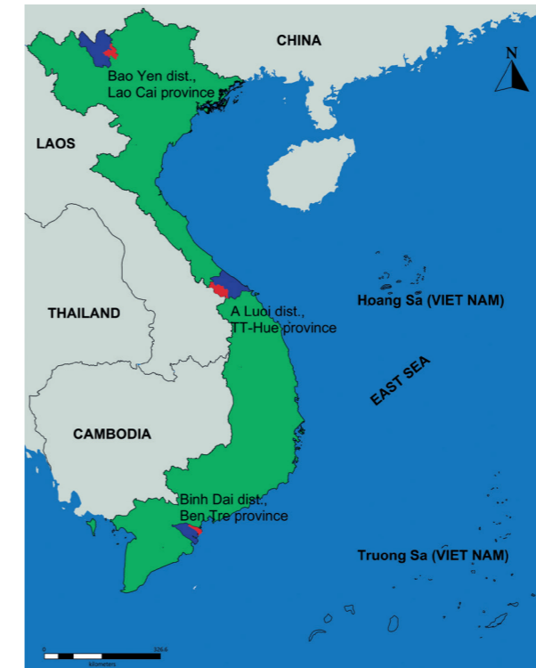
[ Figure 11.3 ] Location of case study areas

interaction between individuals, households, local authorities, private sector actors and market forces. In these conditions, it seems important to provide contextual understanding and grounded insights into the various local-level adaptation practices, to illuminate how different factors can interact and affect the capacity of a community, households and individuals to cope and adapt. It is noteworthy that while it is difficult to prove that the climatic hazards faced by inhabitants are a direct result of climate change, those kinds of climatic stresses are typical of climate change-induced events, and might be exacerbated with climate change. Therefore, we assume that the study of local responses contributes to possible adaptations to future climate change.