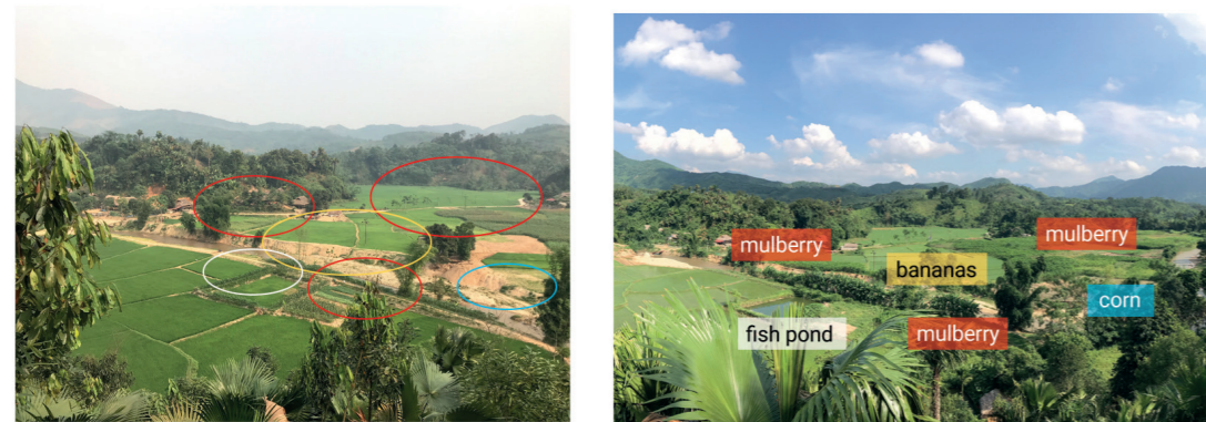
Bao Yen district, Lao Cai.

04/2019 From rice → 07/2020 Bananas, corns, fish pond, vegetable, etc. sericulture