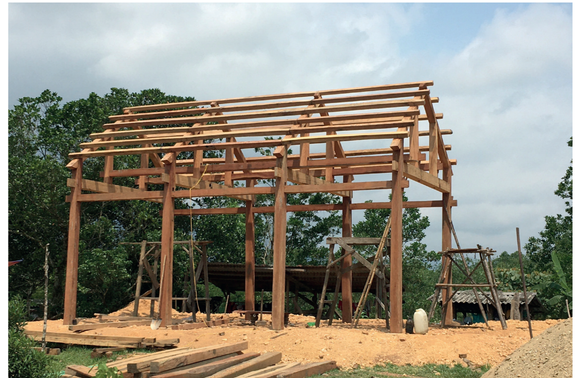
[ Figure 11.9 ] New wooden house building in upper location after flood A Luoi district, Thua Thien-Hue

In the second case study in Central Viet Nam, the popular strategies used to deal with typhoon and flooding include: placing sand bags on the roofs of houses (popular among poor households), moving houses to safer locations [ Figure 11.9 ], or raising the house floor to a higher level. However, local people admit that most of these measures were only reactive, temporary and insufficient to protect them from big floods or severe typhoons. In addition, in the upland area, replacement of cassava with acacia has been the most popular practice for 10 years. However, it has not helped them to alleviate poverty and climate hazard vulnerability, as the land is degrading