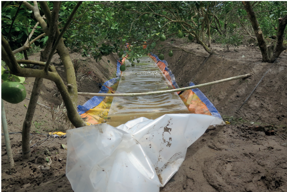
[Figure 11.10] Using plastic socks to store fresh water at the bottom of ditches and furrows

and measures to address root causes of problems like forest protection and reforestation seems to be limited [Figure 11.1 - SP2]. Moreover, investments also need to take other short- and long-term measures into account, such as building concrete dyke systems alongside streams and concrete walls in hill-bottom areas, where there is high risk of landslide [Figure 11.1 - SP6]; enhancing irrigation systems, introducing new rice varieties with shorter life cycles and higher resistance to floods; and supporting post-disaster cultivation recovery [Figure 11.1 - SP1]; reforming transport infrastructure; applying new technologies, and using sustainable materials with high resistance to climate change for construction [Figure 11.1 - SP5].