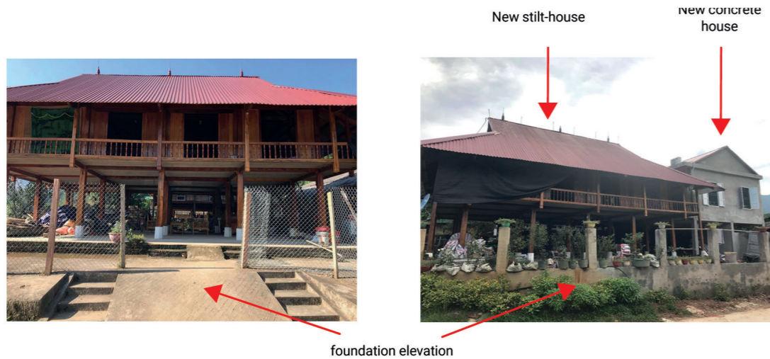
Bao Yen district, Lao Cai.