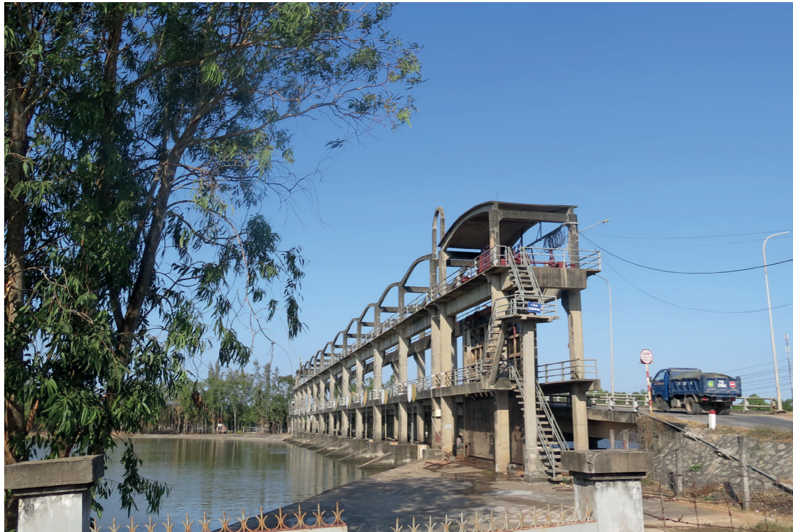
[ Figure 11.12 ] Dam sluice gate on the Ba Lai River to block saltwater intrusion

Binh Dai district, Ben Tre