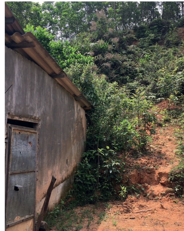
[Figure 11.5] Landslide threaten house

Bao Yen district, Lao Cai