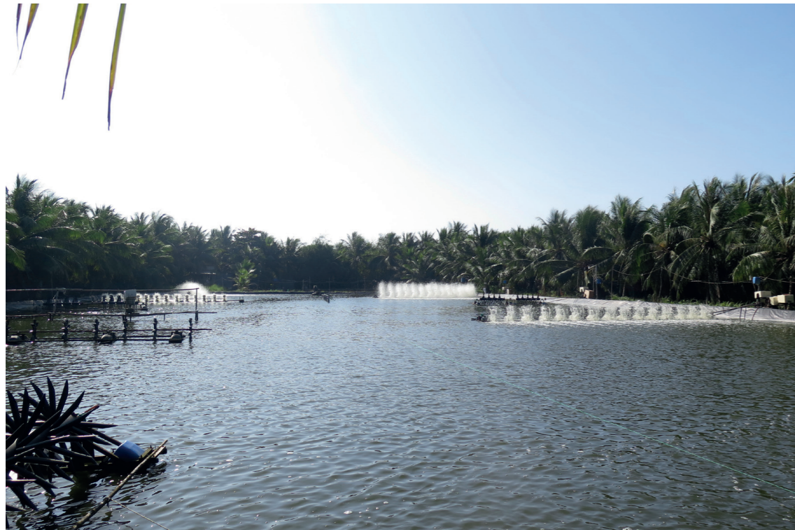
[Figure 11.6] Shrimps and coconut production: a market-oriented agriculture

The third case study takes place in Binh Dai district in the Mekong Delta of Vietnam. This district promotes agricultural, industrial and fishery extension activities, and applies production models focused on safety, efficiency, and sustainability. Cropping coconut, vegetables, fruit trees, shrimp, and fish farming account for a substantial proportion of the local agriculture sector. In the aquaculture sector, shrimp farming largely dominates in Binh Dai. There is a trend for shrimp farming development in the intermediate zone of the district, although coconut cultivation practices remain predominant [Figure 11.6].