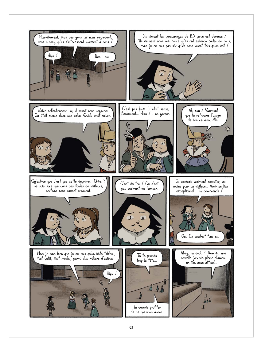
Fig. 3 : Jean Dytar. Les Tableaux de l'ombre . Musée du Louvre Éditions / éditions Delcourt, 2019, p. 63. © Musée du Louvre Éditions / éditions Delcourt / Jean Dytar.

Here the Louvre is not just any publisher, since it plays a role inside the story, within the enunciation. Though it is admittedly difficult to differentiate between the authors' and publisher's intentions, it is up to the latter to choose the generic scene: fictional picture books and comic books are enticing genres to children, promising entertainment and emotion. Furthermore, Delcourt's young adult version of the comic book collection co-published with Futuropolis (29 publications, 2005-), consistently uses the museum as the story setting. In order to come up with an original fiction, the authors are thus compelled to structure what we might call a counterpoint scenography, distinguishing their work in contrast to previous Louvre ethos that attempt to refute it, even though it is not clear if it is deterring the young audience. Furthermore, we should note that publications targeting the widest possible readership, such as Timoté Visits the Louvre and, more re-