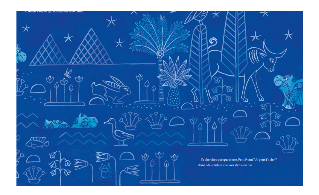
Fig 1. Géraldine Elschner, Anja Klauss. Petit Noun et les signes secrets (Louvre) . Paris : Louvre éditions ; Saint-Pierre-des-Corps, L'élan vert, 2020. © Petit Noun et les signes secrets (Louvre) . L'Élan vert, 2020.

Rather than grounding the visit in the child's daily routine, other books try to depict the visit as a special occasion, infusing it with mystery, fantasy, and magic. All the picture books, whether it be Petit Noun et les signes secrets or the Delcourt series, set the principal part of the plot at moments when the museum is closed, notably at night. Géraldine Elschner and Anja Klaus's picture book is steeped in this nocturnal atmosphere: the little turquoise hippopotamus stands out against a dark blue starry background, while "mysterious signs," or hieroglyphs, float around him, as pale blue as the Egyptian landscape he dreams of.