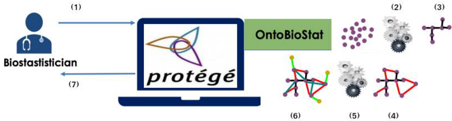
Figure 1. Decision-support pipelines and steps (1: User enters the two first variables names as instances and define their classes: (i) Exposure_stressor and Outcome , (ii) Theoretical_Class , 2: User activates reasoner, 3: Automatic construction using existent generic instances (purple) and causal relations (black), 4: User adds covariates and causal relations (red), 5: User refreshes the reasoner, 6: OntoBioStat provide inferred classes (yellow) and new object properties (blue), 7: Lecture of the results and inferences explanations.)

Decision-support based on OntoBioStat requires several exchanges of information between the biostatistician and the Protégé (Figure 1).