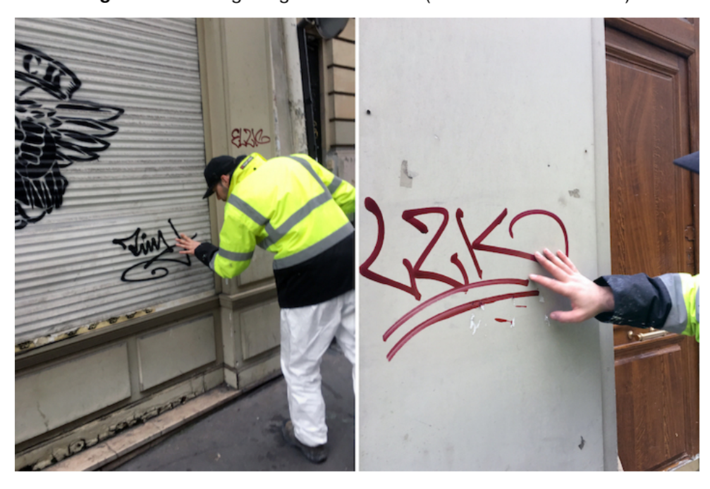
Figure 4. Touching the graffitied surface

For instance, before removing a graffiti, the workers we observed spent several minutes touching the graffitied surface so as to estimate the degree of penetration of the graffiti paint into the stone, examine the invasiveness of an acid-based ink on a shop window, or anticipate how well the covering paint will hold in contact with the surface's components depending on the weather conditions (figure 4).