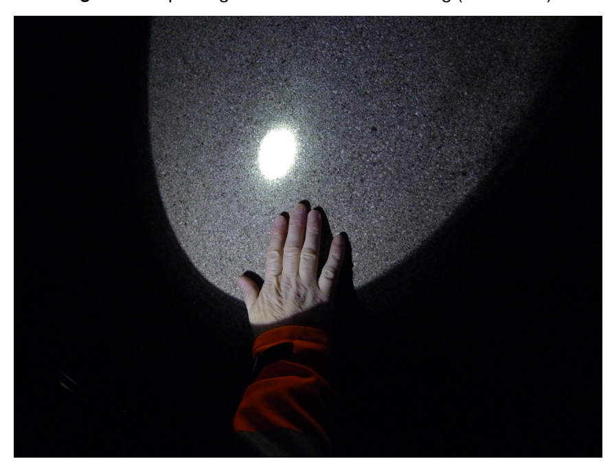
Figure 1. Inspecting a water reservoir: touching