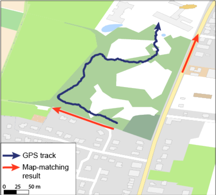
Figure 2. Example of one of the 188 excluded observations after the map-matching step resulted in two sub-paths.