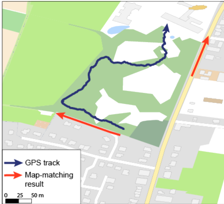
Figure 2. Example of one of the 188 excluded observations after the map-matching step resulted in two sub-paths.