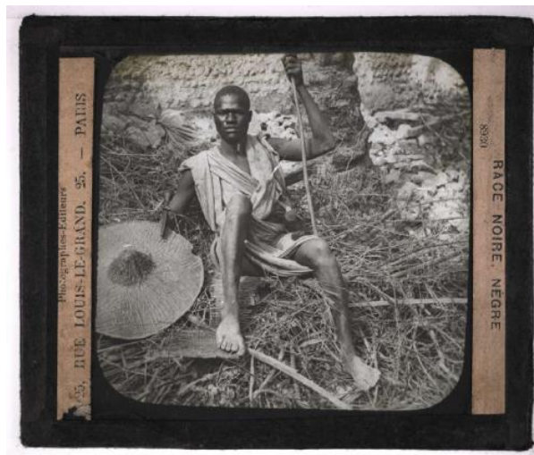
Races humaines. Race Noire. Nègre, Vue sur verre d'une série diffusée par le Musée pédagogique, Lévy & ses Fils, Photographes-Éditeurs, vers 1900. © Réseau-Canopé/Le Musée national de l'Éducation.

The history of education is an essential way into understanding state-building and citizenship, including the maintenance and reproduction of racial ideologies. “Race”, a socially constructed category, is a legacy of European nation and empire building and European education systems have therefore been shaped by racialized social systems arising from Europe’s varied imperial, post-colonial, and totalitarian pasts.